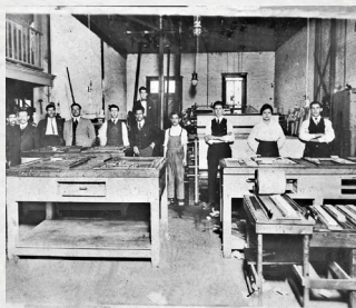
Above: Employees in print shop of El Progreso newspaper. Jovita Idar is on the right. 1914.

Learn more about her at jovitaidar.utsa.edu