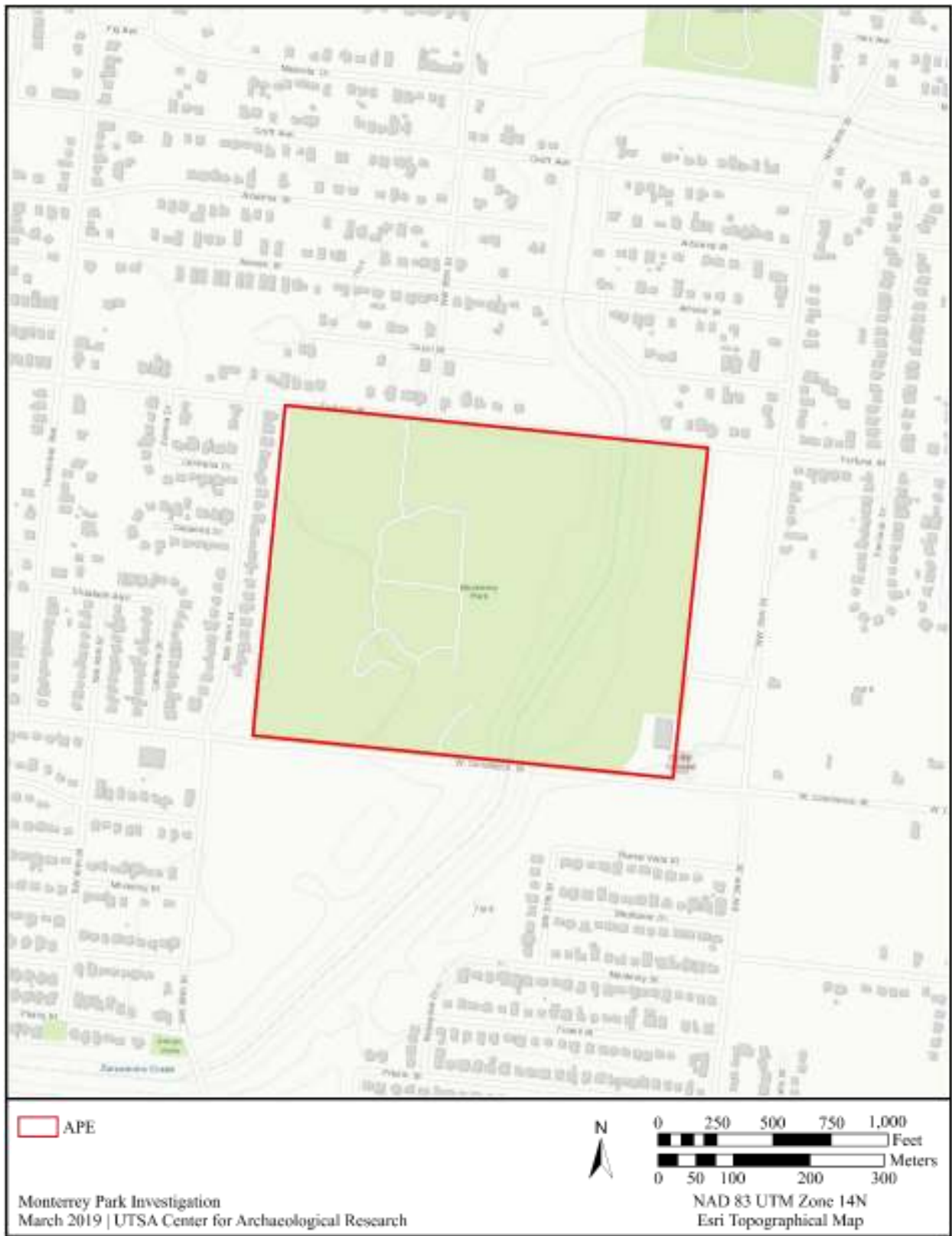
Figure 1-2. The APE depicted on an Esri Topographical Map.