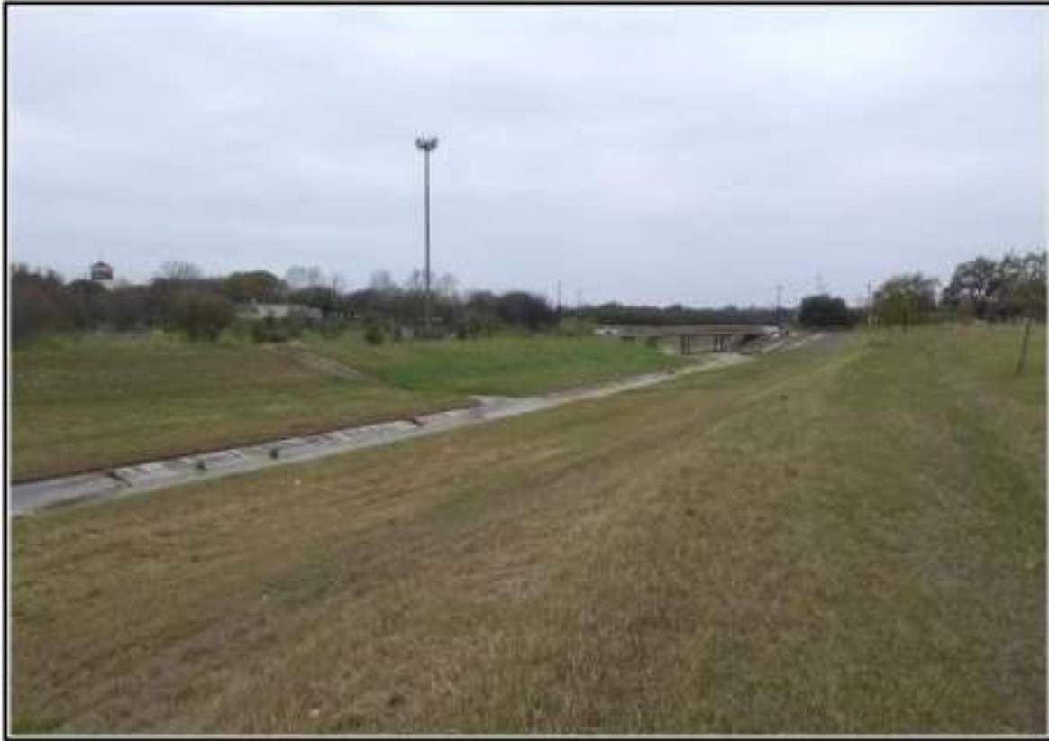
Figure 2-2. Zarzamora Creek facing southeast towards the Commerce Street bridge.