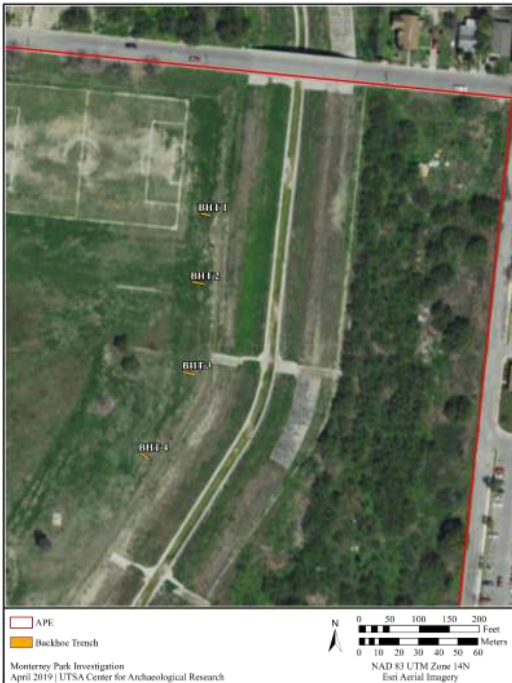
Figure 4-1. Aerial image of the APE displaying backhoe trench locations.

On March 4, 2019, CAR staff conducted exploratory backhoe trenching within Monterrey Park along Zarzamora Creek (Figure 4-1). Four backhoe trenches (BHTs) were excavated during CAR's investigations. No cultural material or archaeological sites were encountered or recorded during the investigation.