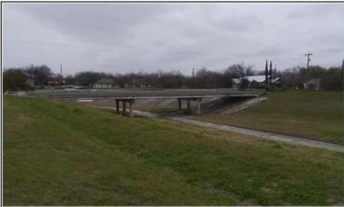
Figure 2-1. Zarzamora Creek facing northeast towards Fortuna Street bridge.

The soil series present in the APE are represented by the Tinn and Frio soil complex (Tf). This soil type is a clayey loam that occurs along flood plains (Natural Resources Conservation Services 2019). Zarzamora Creek runs along the eastern portion of the APE. The creek originates in northern Bexar County and stretches 12.7 km (8 miles) through the western part of San Antonio, where it terminates at San Pedro Creek (Texas State Historical Association 2010). The portion of the creek along the APE has been channelized (Figures 2-1 and 2-2).