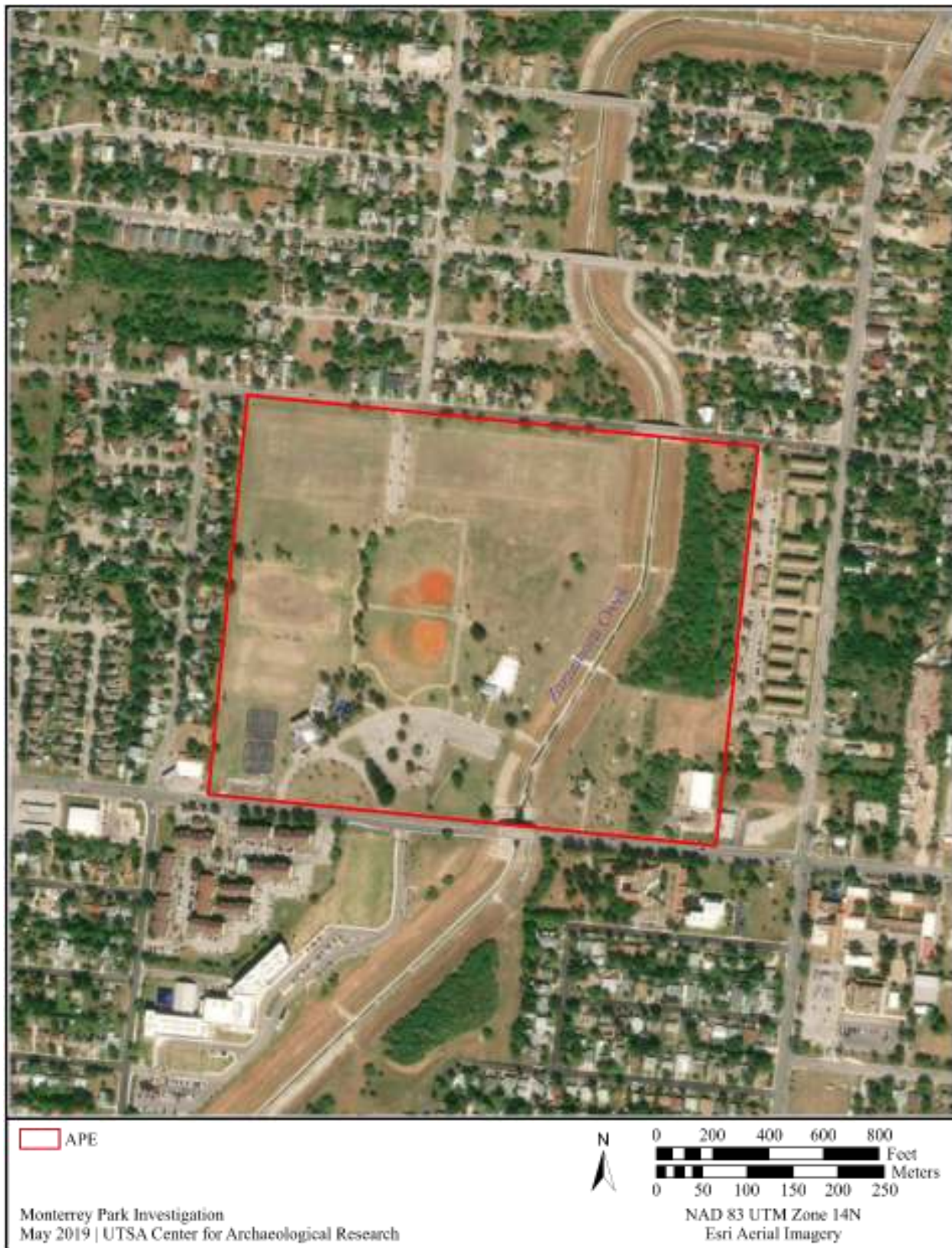
Figure 1-1. Location of the APE on Esri aerial imagery.