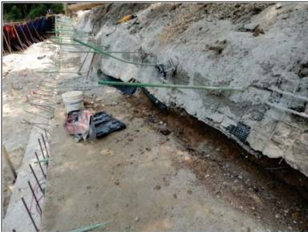
Figure 5-6. Excavations of French drain as documented May 10, 2016.

The French drain sits atop a horizontal concrete apron and lies 1.2 m (4 ft.) below the top of the embankment (Figure 5-8). Contractors used sledge and jackhammers to break up a concrete skirt that extends to the crest of the riverbank. Once the concrete was cleared, contractors hand excavated the trench for the French drain. The drain extends the length of the wall construction, and contractors encountered no intact soils while excavating the French drain.