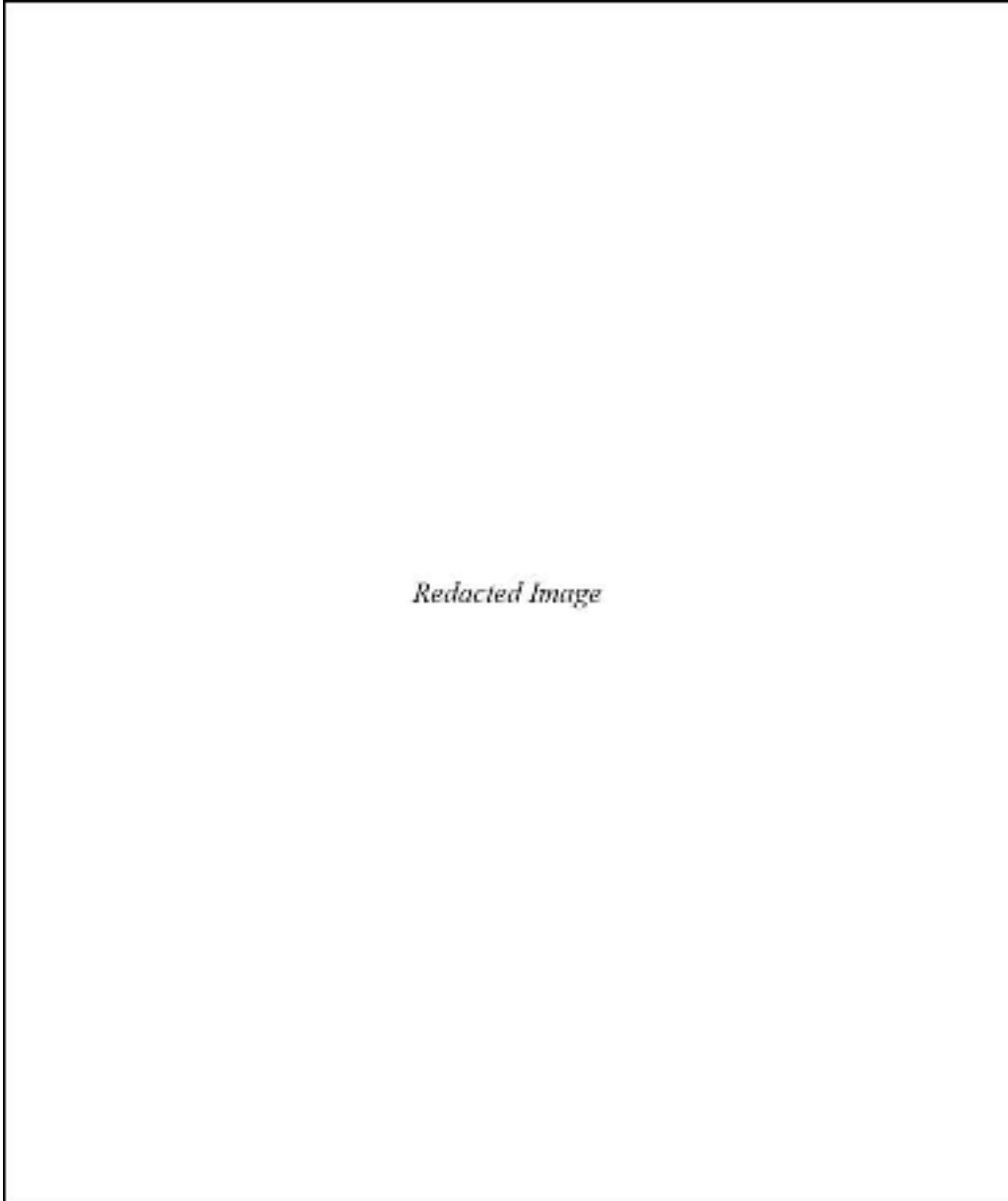
Figure 3-1. Historic archaeological sites within 1 km (0.6 mi.) of the APE.