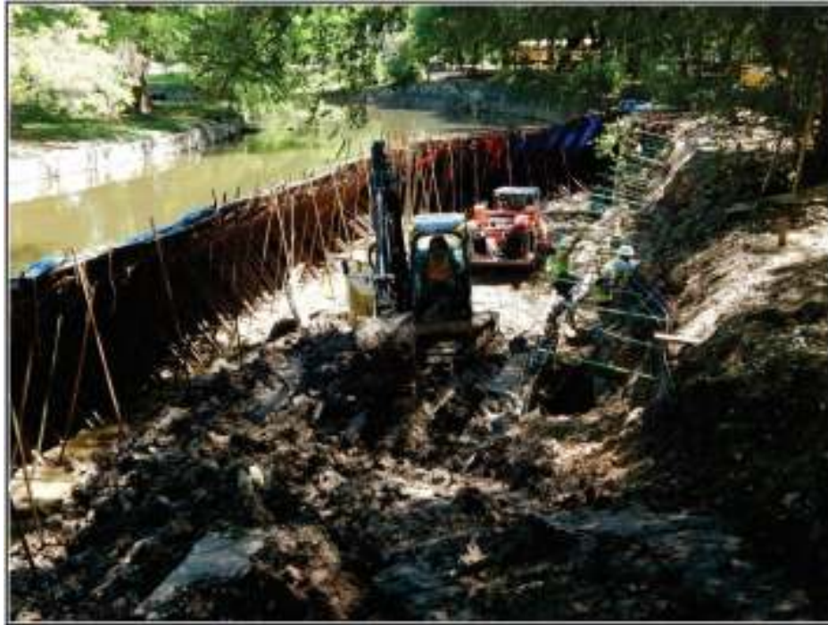
Figure 5-3. Dam installed to permit access to the riverbank.

On April 27, 2016, the contractor excavated a drain pipe and junction box for a manhole. This drain pipe will direct water flow into the river and is 4.9 m (16 ft.) from the junction box to its exit point, 1.2-m (4-ft.) deep and 0.6-m (2-ft.) wide (Figures 5-4 and 5-5). The matrix was imported fill atop a natural caliche base. Next, an area 0.5 m 2 (5 ft. 2 ) and 1.5-m (5-ft.) deep was excavated for the junction box. This matrix appeared intact, and caliche undergirded the soil matrix. This excavation contained no cultural material except a modern bottle glass fragment.