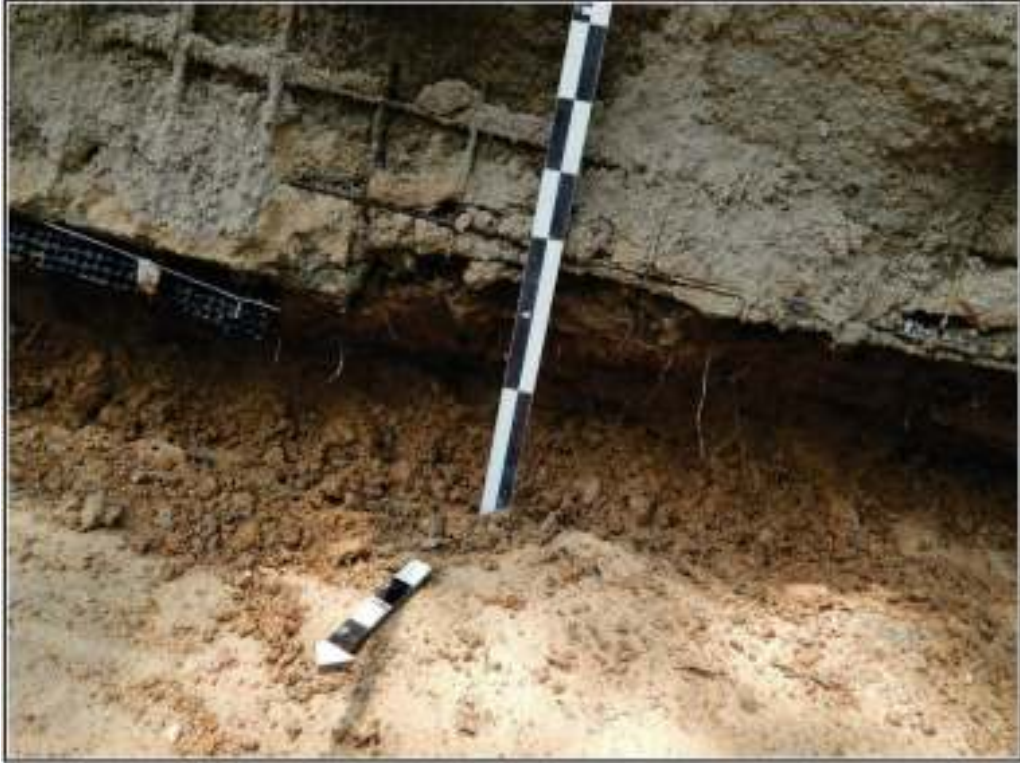
Figure 5-7. Vertical extent of excavation of French drain.