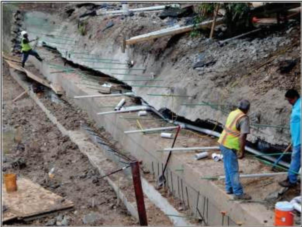
Figure 5-8. Installation of French drain.