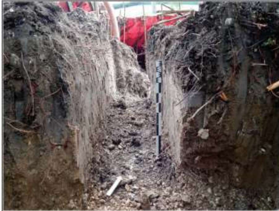
Figure 5-4. Drain pipe trench junction box excavation.