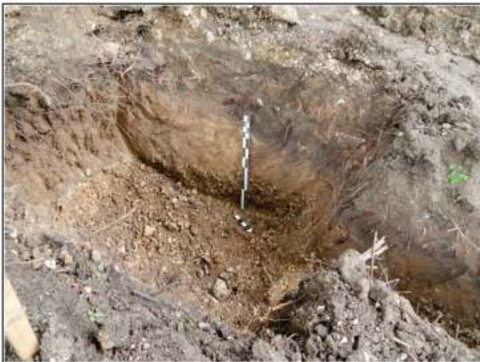
Figure 5-5. West wall of the junction box excavation.