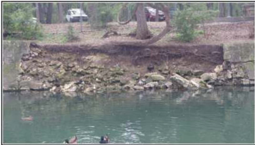
Figure 5-1. Photograph of historic river wall in 2013.

The Project Archaeologist (PA) photographed the project area in 2013 (Figure 5-1). On January 13, 2016, AEI informed CAR that the contractor had begun removal of the historic wall without giving prior notification. The contractor had demolished part of the historic wall the previous day, and AEI halted work upon learning the contractor had failed to notify CAR prior to beginning construction. It was determined that 14 m (46 ft.) of the historic wall had been removed (Figure 5-2). The contractor excavated 1.5-1.8 m (5-6 ft.) of matrix from the riverbank behind the historic wall. The PA inspected the spoils and discovered no archaeological material. Monitoring of excavations continued on January 14 and 15 with no significant findings.