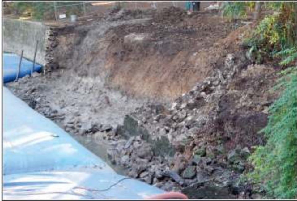
Figure 5-2. Excavations as documented by CAR on January 13, 2016.

To continue excavations, the contractor installed a dam and excavated a ramp to admit equipment to the base of the wall (Figure 5-3). On February 11-12 and April 14-15, 2016, the PA monitored the positioning and excavation of this ramp. The contractor planned to install a French drain at the base of the riverbank parallel the riverbank that would require impacting to a depth of approximately 0.3 m (1 ft.).