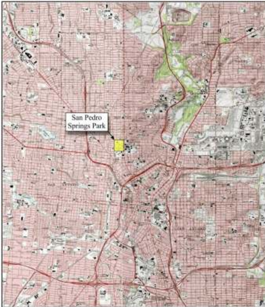
Figure 1. San Pedro Springs Park on the combined San Antonio East and San Antonio West USGS 7.5-minute quadrangle map.

From December 15-18, 2014, the Center for Archaeological Research (CAR) at The University of Texas at San Antonio (UTSA) conducted archaeological monitoring of trenching and air tilling for irrigation facilities at San Pedro Springs Park. This work was done under contract with the City of San Antonio (COSA) Parks and Recreation Department. San Pedro Springs Park (41BX19) is a significant historic and prehistoric site. The 46-acre park is listed on the National Register of Historic Places (NRHP) and is a State Antiquities Landmark (SAL). The park is one of the oldest municipal parks in the United States (Eckhardt 2014). Figure 1 shows the park on the combined San Antonio East and San Antonio West USGS 7.5-minute quadrangle map. The park is bound by San Pedro Avenue, West Ashby Place, North Flores Street, and Myrtle Street (Figure 2).