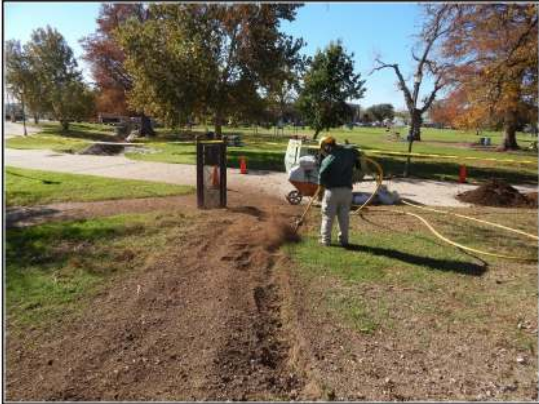
Figure 8. The air tilling process in progress.

Finally, a pneumatic boring tool called a “bullet” was used to excavate small tunnels beneath the sidewalk. The boring bullet was employed only once within the area of potential effect. This excavation was located in Zone 1 and took place beneath the sidewalk adjacent to the building housing the pool pump (see Figure 9). A tie-in trench was excavated to access a water valve located at the northwest end of the pump building. To accommodate the pneumatic boring tool, the mini-excavator expanded the dimensions of the trench to approximately 42-cm wide and 51-cm deep. Excavation of this trench was monitored throughout. The matrix appeared to consist of imported modern caliche fill and clay topsoil fill that contained no artifacts or other archaeological resources. Munsell (2000) values of the caliche were a light yellowish brown 10YR6/4. The clay topsoil above the caliche was dark grayish brown and mostly uniform in color with a Munsell (2000) value of 10YR5/2. No intact soil was encountered in this excavation. The pneumatic boring spanned beneath the sidewalk approximately 2 meters (m), and the matrix resulting from this activity was consistent with that observed in the tie-in trench. The boring matrix was devoid of artifacts and other archaeological resources. Occasional pieces of modern material, such as plastic and unidentified metal, appeared during this activity.