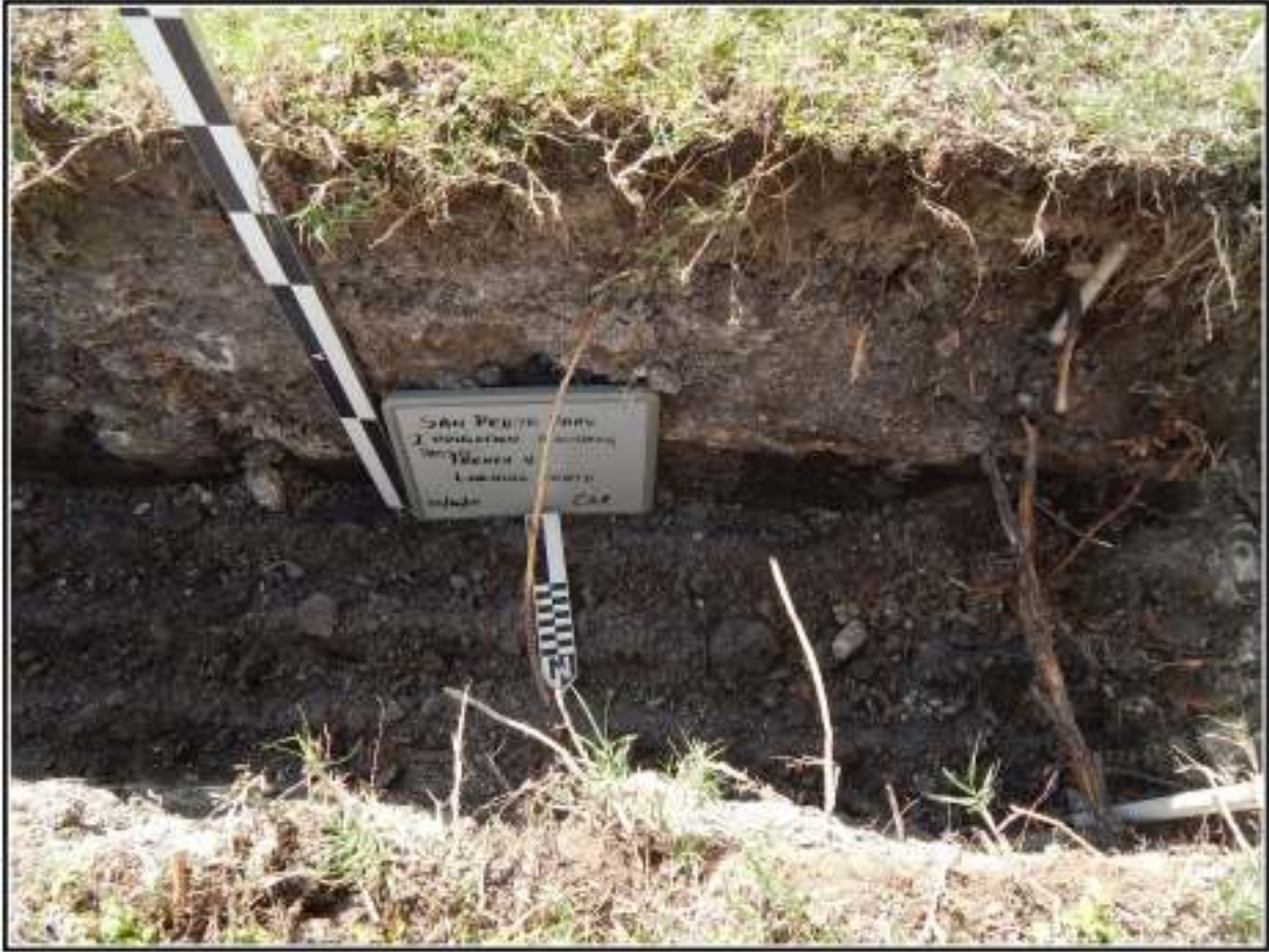
Figure 10. Trench outside monitored area showing band of possibly intact soil. All of this potentially intact soil was screened.