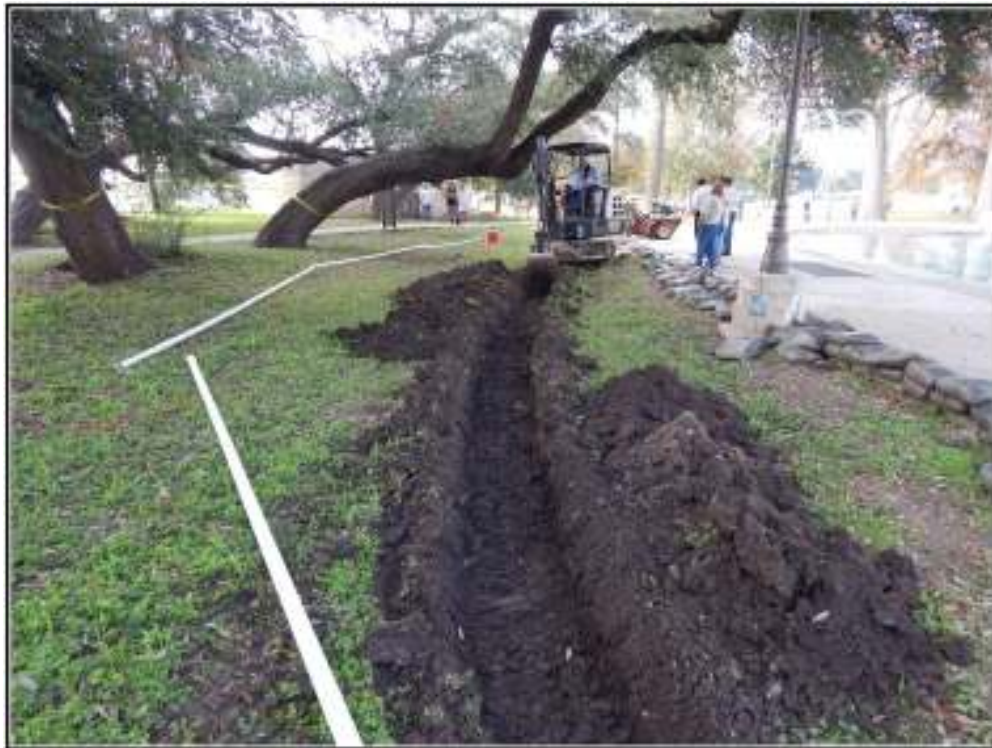
Figure 7. The mini-backhoe in operation.