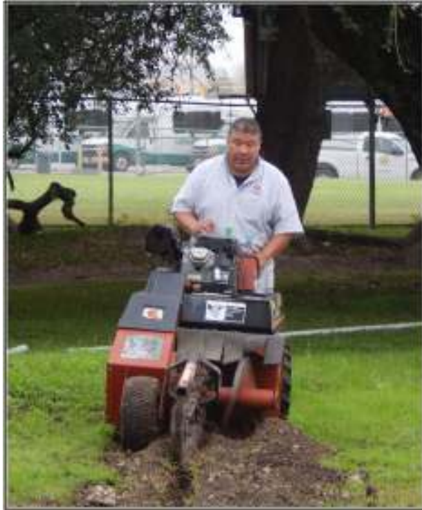
Figure 6. The hand-operated walk behind trencher.