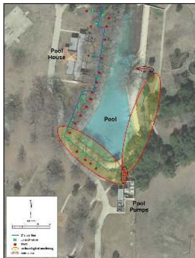
Figure 3. Proposed trenching locations to be monitored.

Summaries of the history of the San Pedro Springs attest to its cultural importance (see Campbell and Campbell 1985:37; Cox 2005; de la Teja 1995; Foster 1995:99; Grimm 2001; Habig 1968; Hatcher 1932; Hoffman 1935, 1938). In May 1718, the newly appointed Governor of Coahuila, Martín de Alarcón, selected an area near San Pedro Springs in which to locate a new presidio (Hoffman 1935:49). Alarcón's selection constituted the founding of what was later to become San Antonio (Houk 1999). Then in January 1719, an acequia was constructed to supply water to this presidio and its families (Chipman 1992:125).