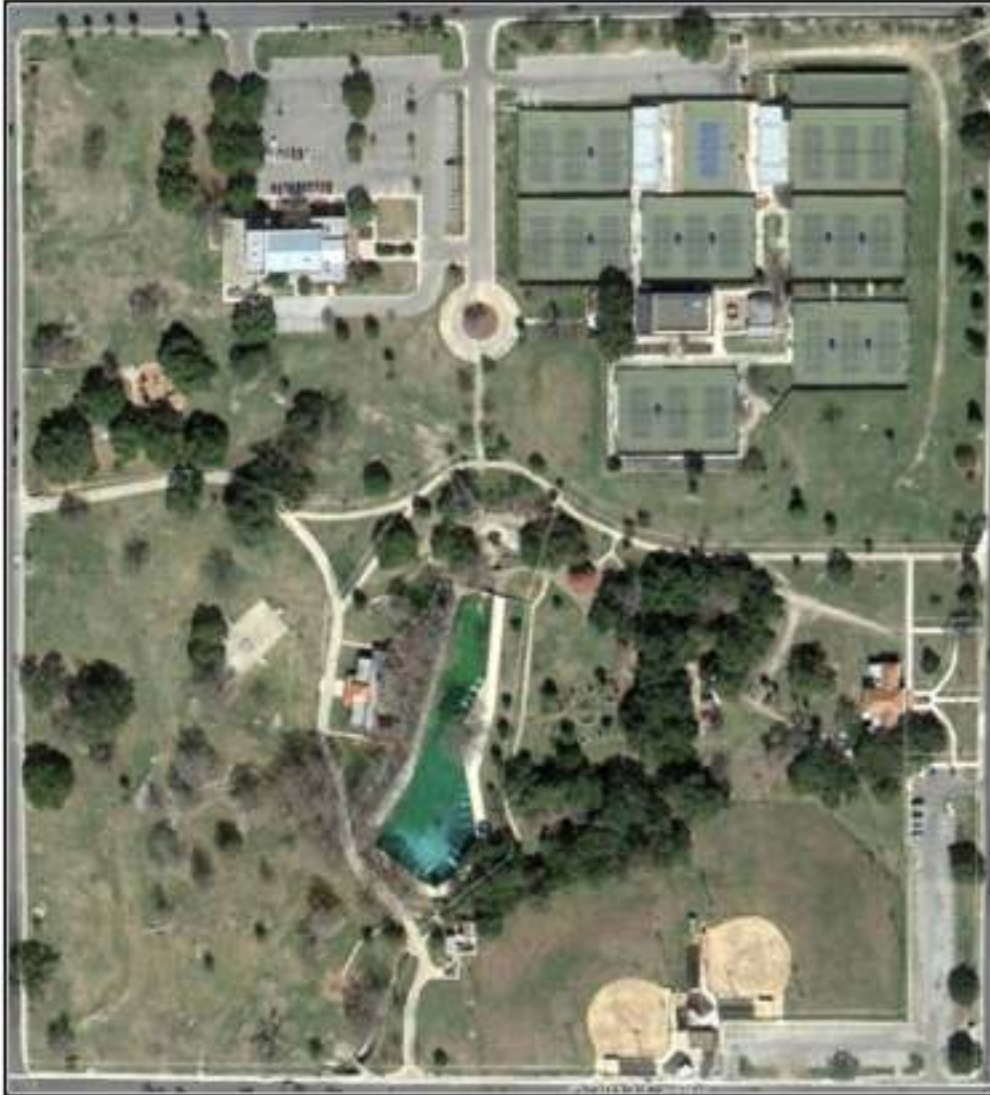
Figure 2. Aerial view of San Pedro Springs Park.

The park houses several recreational facilities including the San Pedro Playhouse, a tennis center, a branch of the San Antonio Library, two softball fields, and a swimming pool and associated bathhouse. Sidewalks, parking lots, playgrounds, picnic tables, and support facilities are also present. For the current project, the area of potential effect is located just to the south and east of the swimming pool (Figure 3). The COSA Parks and Recreation Department installed an irrigation system to support cypress trees that currently ring the western, southern, and eastern side of the pool. Because of the landmark status and public ownership of the project area, the archaeological work was performed under Texas Antiquities Permit No. 7103 and in accordance with the applicable provisions of the Antiquities Code of Texas (Title 9, Chapter 191 Texas Natural Resource Code) and the regulations and requirements of the Archeology Division of the Texas Historical Commission (THC).