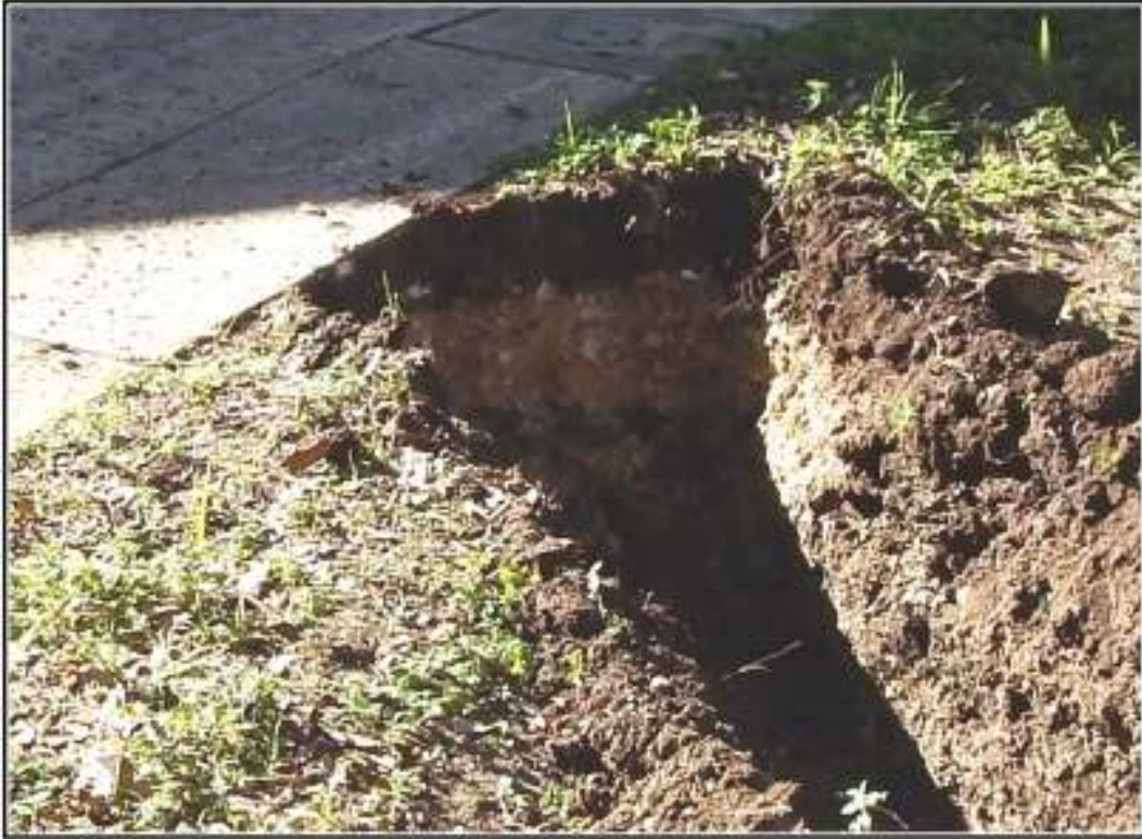
Figure 9. Trench excavated with boring bullet at water valve tie-in location, looking south. Note the disturbed sediment.

The second boring operation and associated trench occurred outside of the area of potential effect by a distance of about 7 m to the west of Zone 2. Although this excavation was outside of the area of potential effect, its proximity to Zone 2 prompted its monitoring. This particular boring spanned a concrete apron and flagstone walkway adjacent to the western edge of the swimming pool (see Figure 6) a distance of approximately 5.8 m. The trench was 50-cm deep and 42-cm wide. Clay topsoil fill covered approximately 20 cm of the profile and was grayish brown in color (10YR5/2; Munsell 2000). The underlying matrix was mostly very pale brown (10YR8/2; Munsell 2000). A narrow band (5-cm thick) of very light colored caliche (10YR8/1; Munsell 2000) capped a very dark grayish brown clay loam (10YR3/2; Munsell 2000). This dark grayish clay loam appeared in the final 10-20 cm of the profile and was thought to be intact sediment (Figure 10). This clay loam was separated from the overlying sediment and screened for artifacts. No artifacts were recovered.