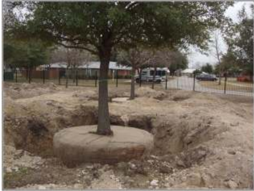
Figure 3-10. Root ball wrapped in burlap and wire mesh ready for relocation.