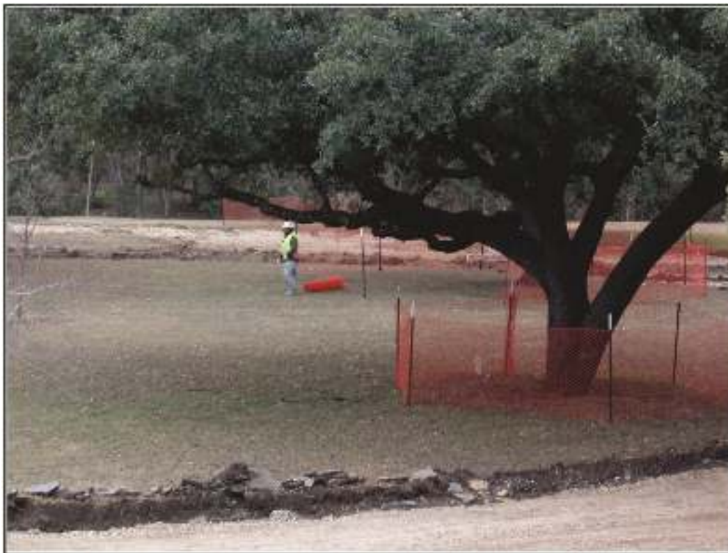
Figure 3-15. Protective fencing around tree and new path through playground.

The ground preparation also included the removal and relocation of trees that would have otherwise been impacted by the new larger playground planned for the area. Nonetheless, a number of the larger trees were left in place to provide partial shade over the play area. These were protected during the demolition process (Figure 3-15). No cultural materials were noted during the demolition in part because the footprint of the playground had already been disturbed during the original construction.