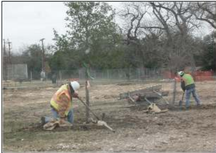
Figure 3-13. Playground demolition, equipment removal in playground.

Demolition of the Mission Concepción Park Playground by Zachry Construction Corporation staff took place on January 11, 2011. The four crews dismantled the equipment both by hand (Figure 3-13) and aided by a Caterpillar (CAT) 246C Skid Steer Loader (Figure 3-13). Following the dismantling of the playground equipment, the surface was graded using the Skid Steer. Approximately 0.5-0.6 m (1.5-2 ft.) of soil was removed in preparation for the installation of base for the new playground.