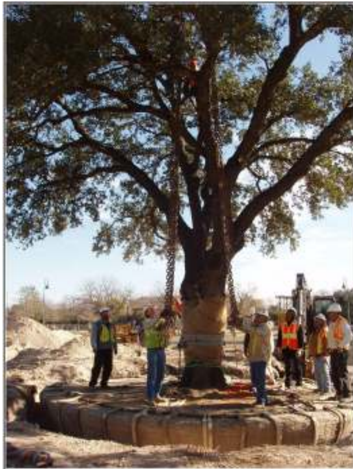
Figure 3-11. Wrapped tree trunk and chains to be attached to allow the lifting of tree.