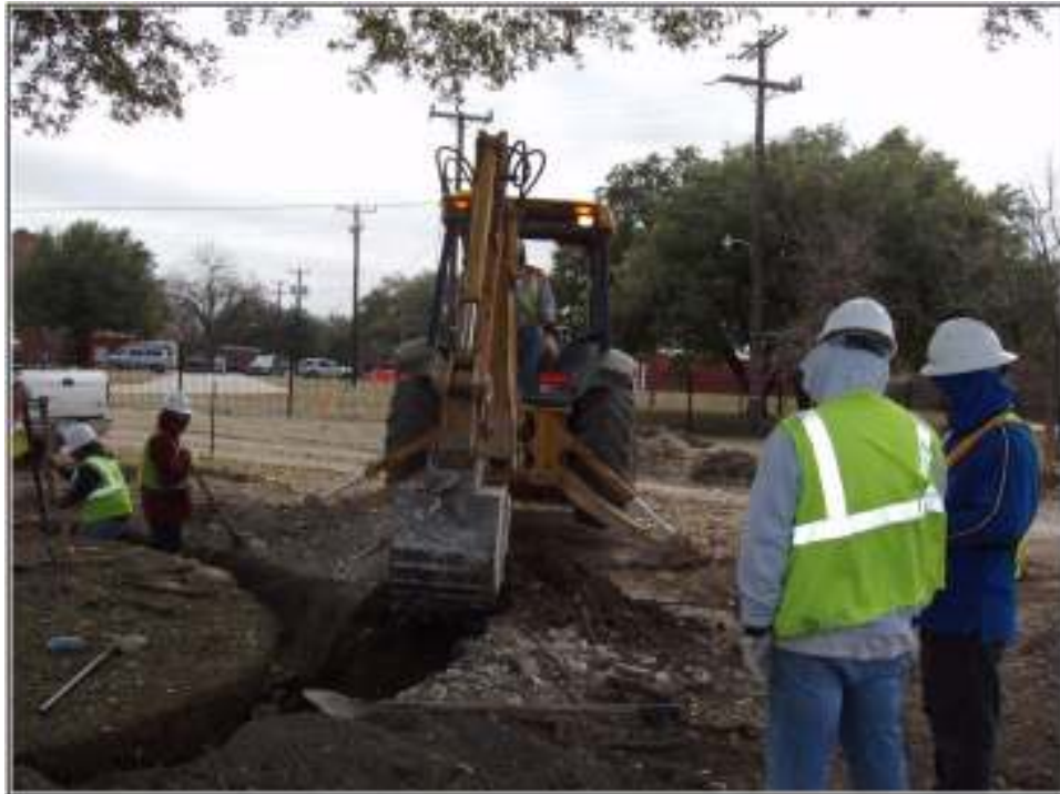
Figure 3-9. Widening of the original trench to allow for wrapping of root ball.