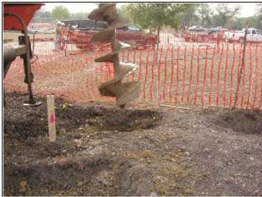
Figure 3-17. Mechanical auger drilling for pier construction for Concepción Portal.