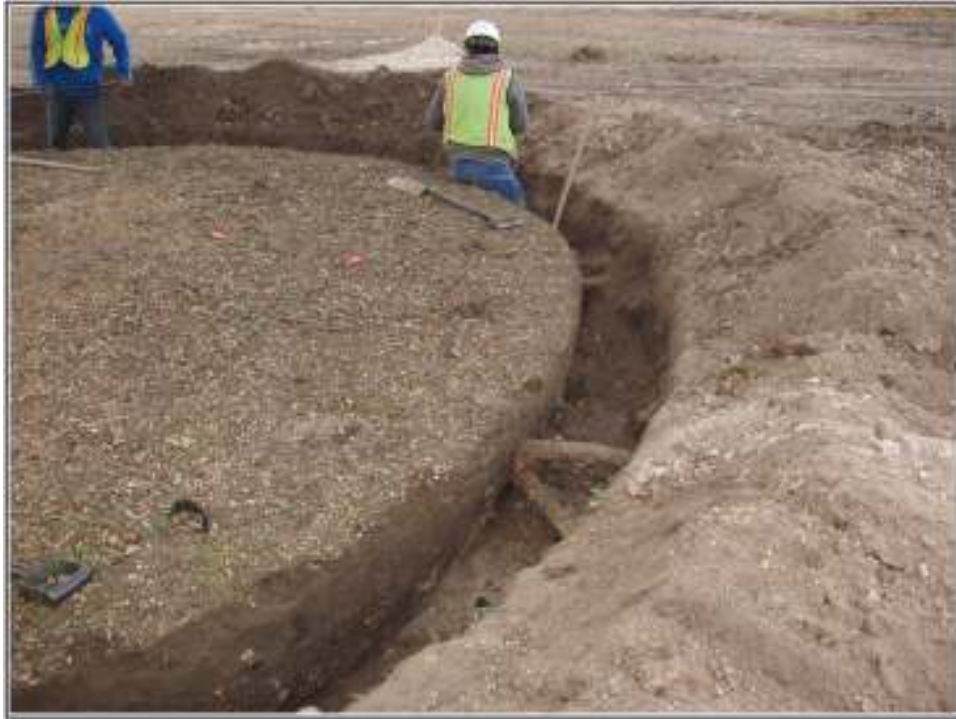
Figure 3-8. Hand-excavated narrow trench around root of tree slated for relocation.