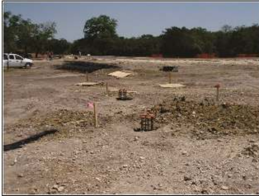
Figure 3-16. Alignment of auger holes along the Concepción Portal stone wall.

Auger drilling was begun in later April 2011 by L & R Construction subcontractors. The auger boring of the 31 pier holes was conducted in the west portion of the APE overlooking the San Antonio River (Figure 3-16). The pier holes were drilled to a depth of 7.6 m (25 ft.) using a 61 cm (24 in.) diameter auger bit (Figure 3-17). The piers were to serve as supports for the foundation beneath the proposed San Concepción Portal.