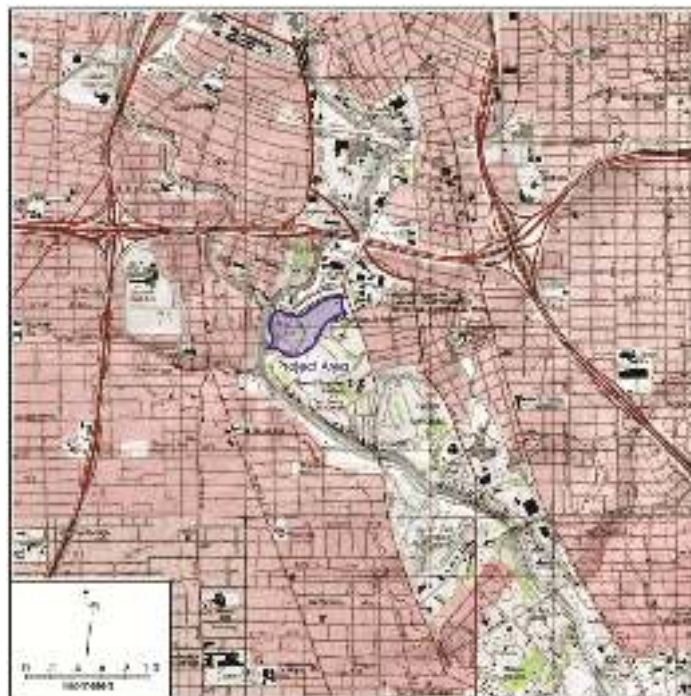
Figure 1-1. Map of the project area on the San Antonio East, Texas (2998-133) 7.5 Minute Series Quadrangle Map.

The construction monitoring project reported on herein was the final stage of work associated with the Theo Avenue realignment project which began in the summer of 2010. Specifically, between May and July of 2010, the Center for Archaeological Research (CAR) of The University of Texas at San Antonio (UTSA) conducted an intensive pedestrian survey of the Theo Avenue Realignment Project Area of Potential Effect (Figure 1-1). Because the planned realignment of Theo Avenue took place within property owned by the City of San Antonio, the construction activities fell under the jurisdiction of the City of San Antonio's Unified Development Code, Chapter 35. Since the project easement was also part of the political subdivision of the State of Texas and a small portion is part of the San Antonio Missions National Historical Park, the activities also fell under the jurisdiction of the Texas Historical Commission (THC) and the National Park Service (NPS), respectively.