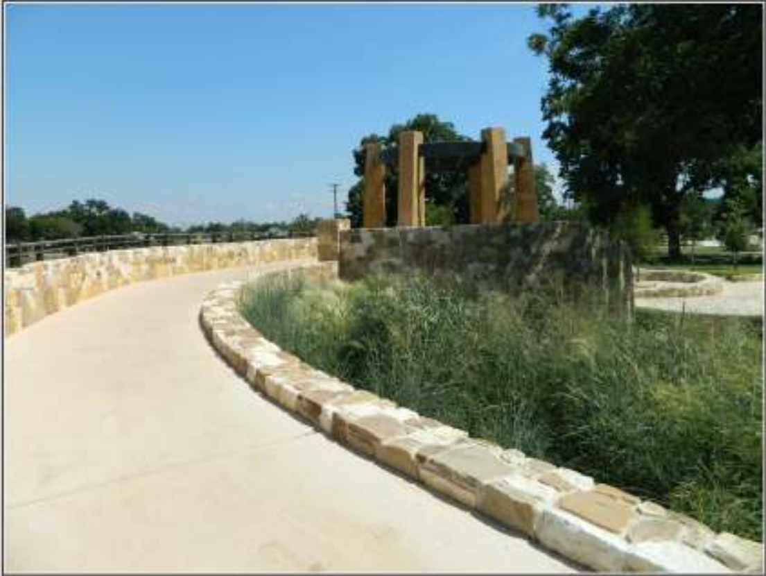
Figure 3-18. Mission Concepción Portal, looking south.