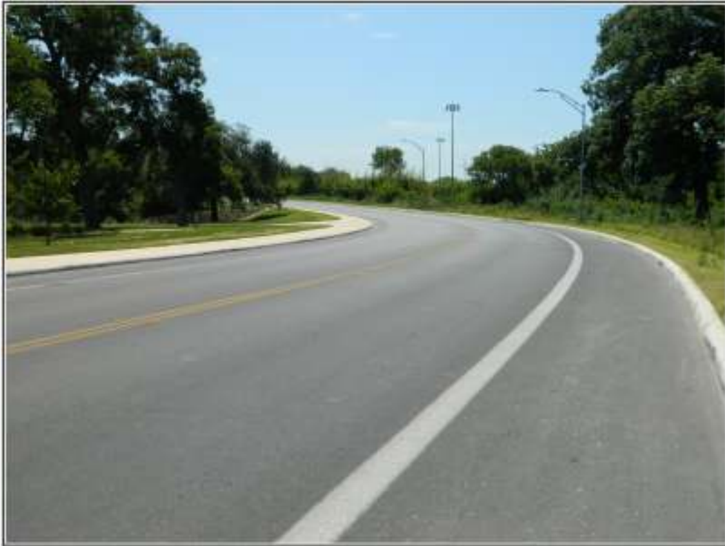
Figure 3-4. Rise in grade along realigned Theo Avenue achieved through the introduction of fill in ROW.

Approximately 2.4-3.0 m (8-10 ft.) of fill was introduced across the middle of the project ROW immediately west of the terrace margin to raise the grade to the appropriate elevation. The rise in the road is visible in a recent photograph taken of this portion of the realigned Theo Avenue (Figure 3-4). No artifacts were collected from this portion of the APE.