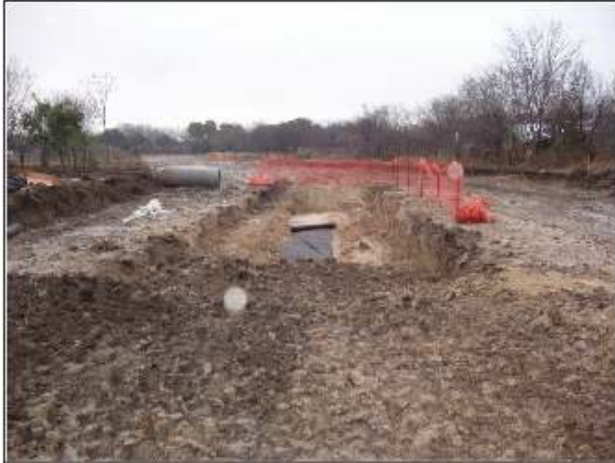
Figure 3-7. Portion of drainage pipe trench backfilled with open trench in background.

Modern trash, including plastic, aluminum, and glass containers, was observed during excavation. No historic or prehistoric artifacts were noted or collected during the pipe installation.