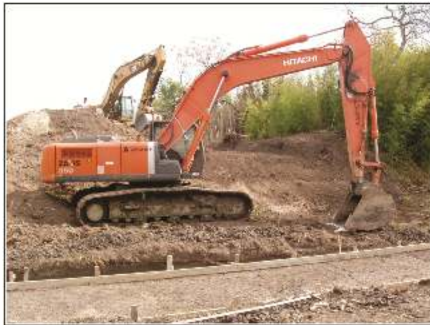
Figure 3-1. Road surface grading in the vicinity of the bridge at the San Antonio River. Note pedestrian path in the foreground.

The preparation of the new road surface involved relatively little excavation. Rather, the bulk of the work associated with road preparation involved shallow grading in the western third of the project area near the bridge over the San Antonio River (Figure 3-1).