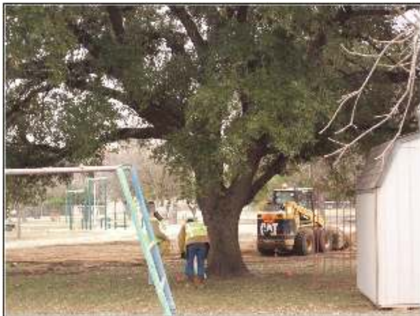
Figure 3-14. Grading of new playground surface using the Skid Steer.