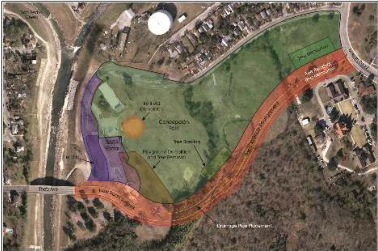
Figure 1-2. Aerial of the project area showing the three areas of the APE as well as the types of ground disturbing activities planned within each.

from 34-40 m (112-131 ft.). The length of the easement from the bridge to Mission Road is estimated to be roughly 720 m (2,362 ft.). The remainder of the APE consists of two other spaces: Concepción Park proper and the SARA Portal. The park extends northward from the proposed alignment and is bound by Theo Avenue on the north side and Mission Road along its eastern edge. The SARA Portal takes up the previous parking lots along the western edge of Concepción Park and extends northward along the original Theo Avenue.