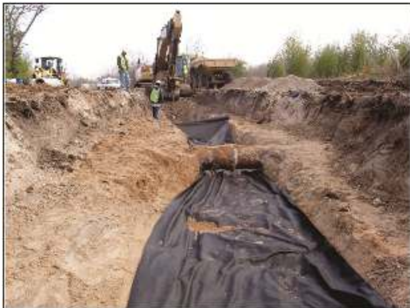
Figure 3-6. Installed concrete drainage pipe covered by sand and fabric. Note intersecting cast-iron pipe.

Pea gravel was laid in the bottom of the central trench to serve as base for the pipes. The 1.5 m (5 ft.) long cement pipes were then lowered one at a time on top of the gravel and connected by the crew using an end-to-end sealant. As the installation and connections were completed, clean sand was introduced on top of the pipes, and a black geologically protective cloth was rolled over the top of all (Figure 3-5). The process was completed by placing backfill excavated from the trench over the underlying cloth, sand, pipe, and gravel (Figure 3-6).