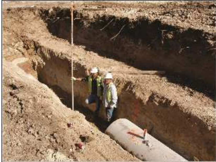
Figure 3-5. Placement of concrete drainage pipe in central backhoe trench.

Pea gravel was laid in the bottom of the central trench to serve as base for the pipes. The 1.5 m (5 ft.) long cement pipes were then lowered one at a time on top of the gravel and connected by the crew using an end-to-end sealant. As the installation and connections were completed, clean sand was introduced on top of the pipes, and a black geologically protective cloth was rolled over the top of all (Figure 3-5). The process was completed by placing backfill excavated from the trench over the underlying cloth, sand, pipe, and gravel (Figure 3-6).