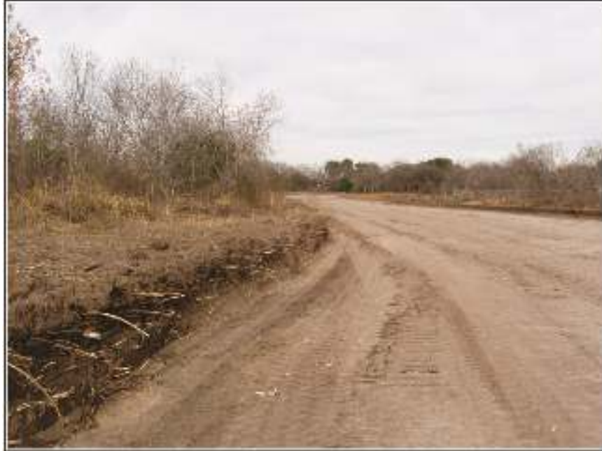
Figure 3-2. Road surface excavation, graded realignment.

Between the western and eastern ends of the road, most of the work involved the placement of fill to raise the road surface so that it reached the top of the San Antonio River terrace. This strategy was chosen to alleviate the need for significant down cutting of the terrace and impact the CCC-era stone wall that was located at the base of the terrace lining the old meander of the river (Ulrich 2011; Figure 3-3).