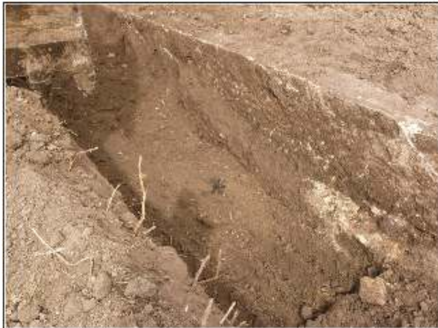
Figure 3-3. Road surface excavation, note exposed CCC-era wall.

Between the western and eastern ends of the road, most of the work involved the placement of fill to raise the road surface so that it reached the top of the San Antonio River terrace. This strategy was chosen to alleviate the need for significant down cutting of the terrace and impact the CCC-era stone wall that was located at the base of the terrace lining the old meander of the river (Ulrich 2011; Figure 3-3).