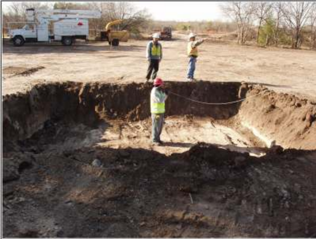
Figure 3-12. New planting hole excavated with backhoe.

The stratigraphy of the newly excavated planting holes nearest Mission Road consisted of a medium-brown silty-loam topsoil, 0-30.5 cmbs (0-12-in.), underlain by an ash-brown clay loam zone, 30.5-76.2/91.4 cmbs (12-30/36-in.). The bottom 15.2-30.5 cm (6-12-in.) within the planting holes contained light tan caliche and gravels (Figure 3-12).