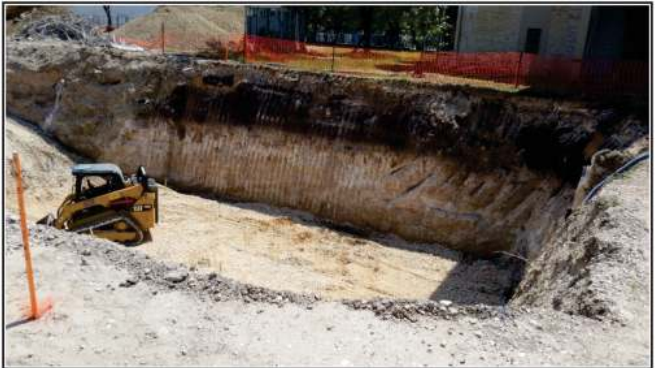
Figure 4-4. Vault excavation at termination depth.