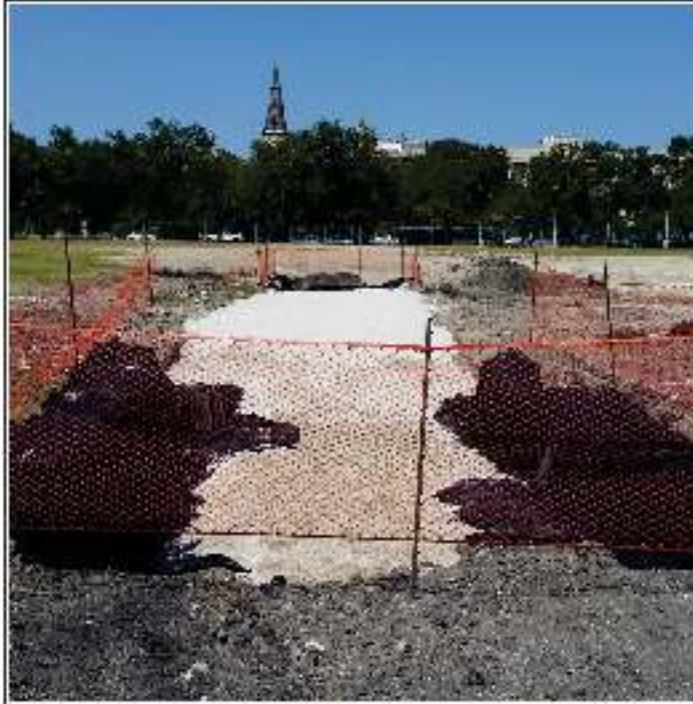
Figure 4-11. Pea gravel covering mid-section, facing north.

the northern and southern ends of the feature maintaining a 3.1-m (10-ft.) distance across the acequia and carefully controlling elevations (Figure 4-12). Once the outer wall plates were set, the crew filled the trenches with gravel, leveled out the top layer of gravel, and placed the steel plates along the top (Figure 4-13). Thirty-two plates were used to cover the top of the 40-m (131.23-ft.) long acequia segment (Figure 4-14).