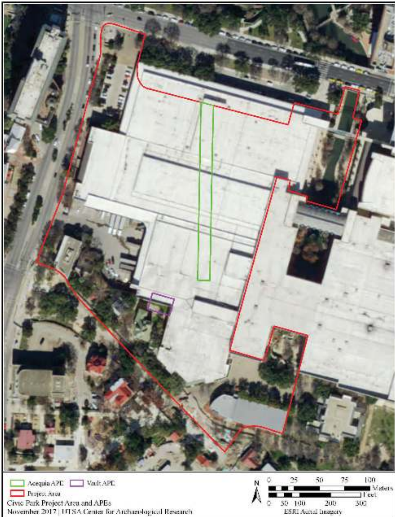
Figure 4-2. Location of project area and APEs on satellite imagery.