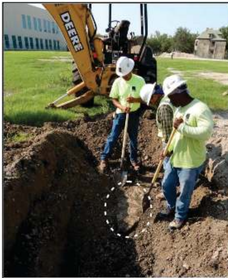
Figure 4-5. First acequia wall stone uncovered (west wall), facing south.

The first acequia wall stone, from the west wall, was uncovered approximately 1.5 m (5 ft.) below the grade (Figure 4-5). As excavation continued to the south, the acequia walls were located closer to the current surface (Figure 4-6). The Project Archaeologist, in consultation with the City Archaeologist, determined which stones were associated with the acequia construction and should remain in place.