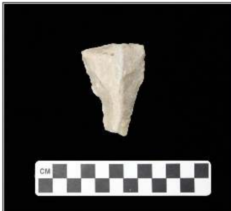
Figure 4-18. Clear Fork gouge unifacial tool recovered from the northwest portion of the project area.