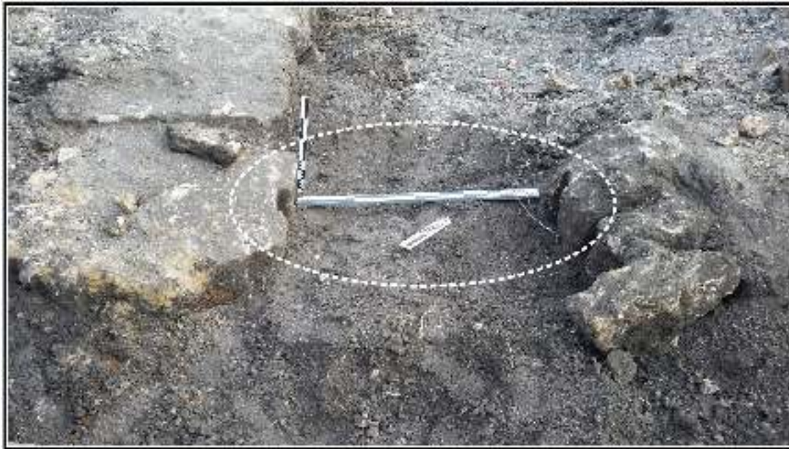
Figure 4-7. Sluce gate feature, facing north.