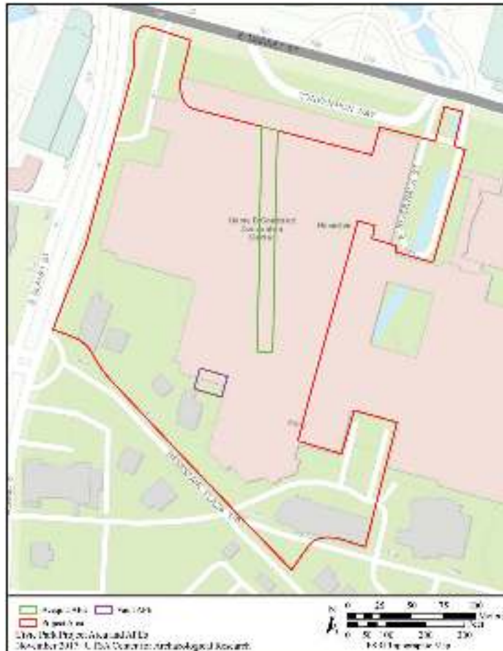
Figure 1-1. Location of project area and APES.

The project area lies within Hemisfair Park, which is located in downtown San Antonio, and is bounded by South Alamo Street, East Nueva Street, Hemisfair Way, and East César Chávez Boulevard. Note that East Nueva Street was previously Goliad Street, and before that it was Camino La Bahia (Zapata et al. 2018). Water Street was also renamed to Hemisfair Way in 2016. The project area included approximately 7.5 acres (3.03 hectares) in the northwest quadrant of the Hemisfair Park (Figure 1-1). A previous phase of this expansion project began with the demolition of the west wing of the Henry B. González Convention Center in 2016 for the proposed Civic Park. The area was known to be in the path of the Acequia Madre de Valero (41BX8). This prompted the need for archaeological monitoring of any below ground disturbances in this area. The COSA contracted Raba Kistner Environmental Inc. (RKEI) to monitor gas line installation and, subsequently, to test the project area for remnants of the acequia (see Nichols et al. 2017).