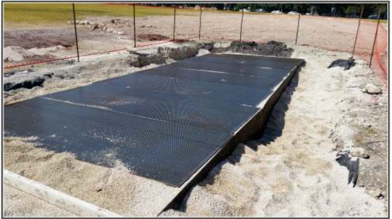
Figure 4-13. Northern end encased with gravel and three sides of plates, facing northwest.