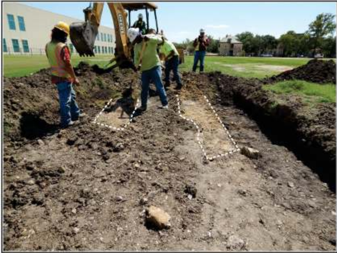
Figure 4-6. Acequia wall exposure (both east and west wall), excavation continuing southward.

The excavator uncovered the sluice gate feature at the southern end of this segment of the Acequia Madre de Valero (Figure 4-7). The notched terminal stones were located 1 m (3.28 ft.) apart. The west wall stone measured 85 cm (33.46 in.) in length (north to south) and 87 cm (34.25 in.) in width (east to west), while the east wall stone measured 50 cm (19.69 in.) in length (north to south) and 55 cm (21.65 in.) in width (east to west). Tomka et al. (2017:48-49) measured a channel width of 2.6 m (8.53 ft.) at the sluice gate, as well as the presence of two notched, flat, rectangular stones in the bottom of the ditch. Because the intent of the acequia mitigation was to expose the top of the walls, CAR did not attempt to locate the flat stones.