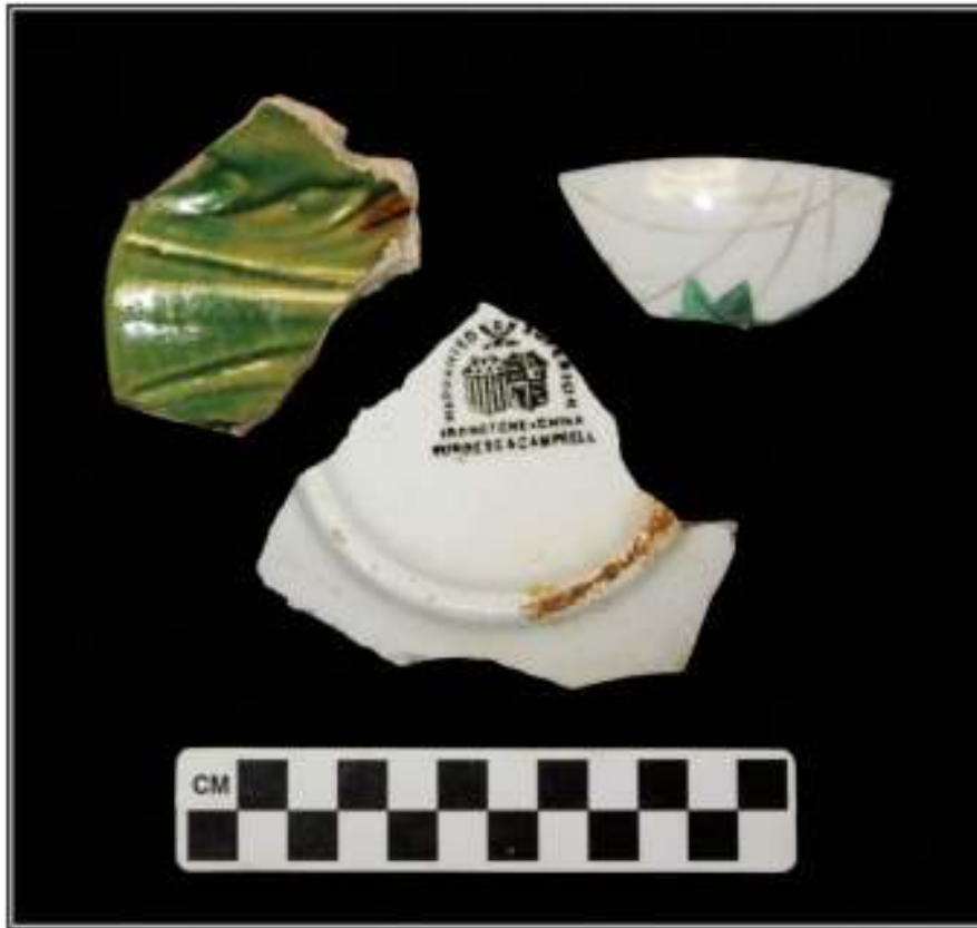
Figure 4-17. Palissy Wear, Ironstone, and hand-painted ceramics (left to right).