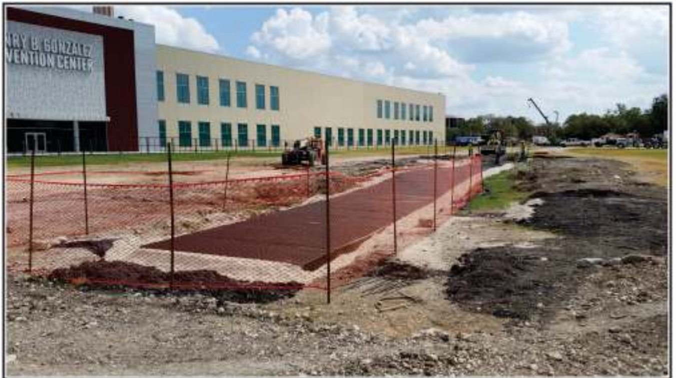
Figure 4-14. The 40-m (131.23-ft.) acequia segment covered, facing southeast.