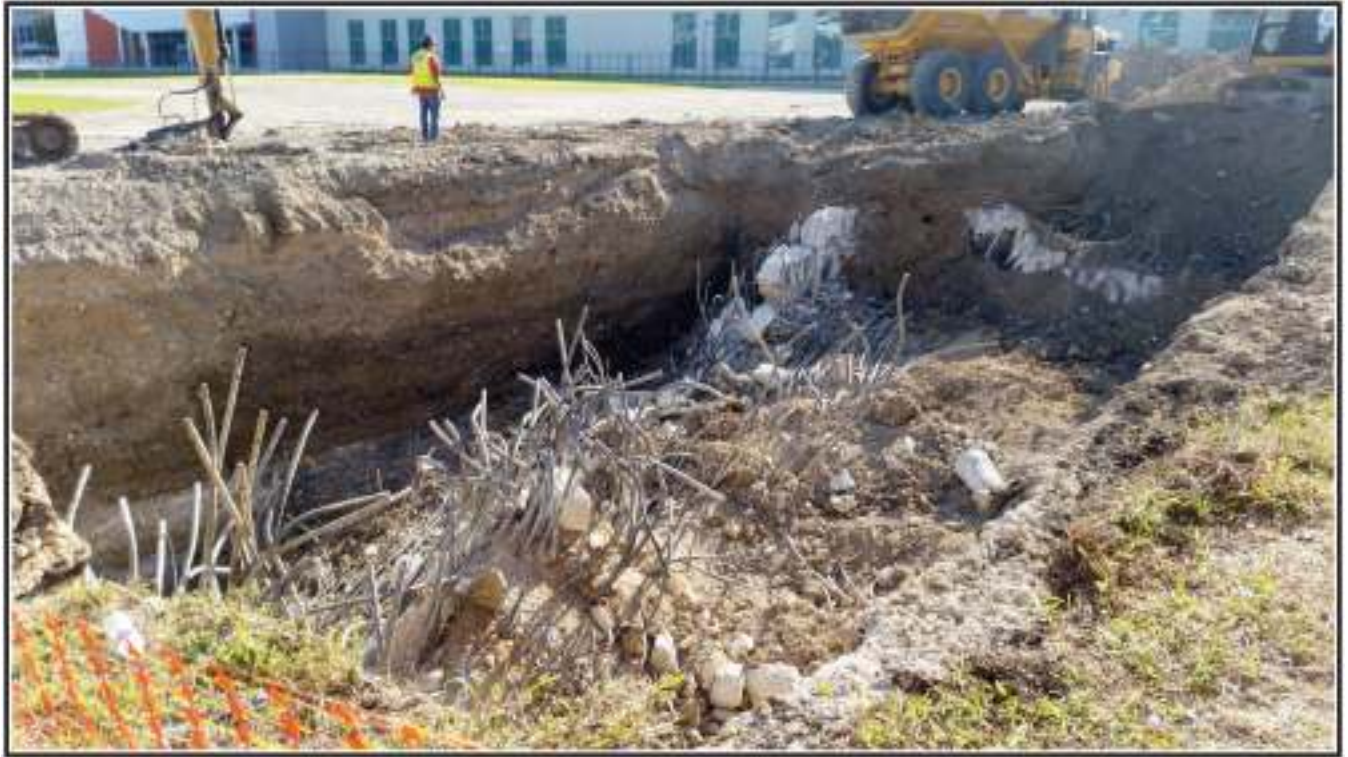
Figure 4-3. Vault excavation, note concrete and rebar.