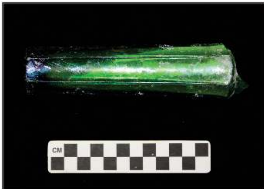
Figure 4-16. Caper bottle found in acequia fill.