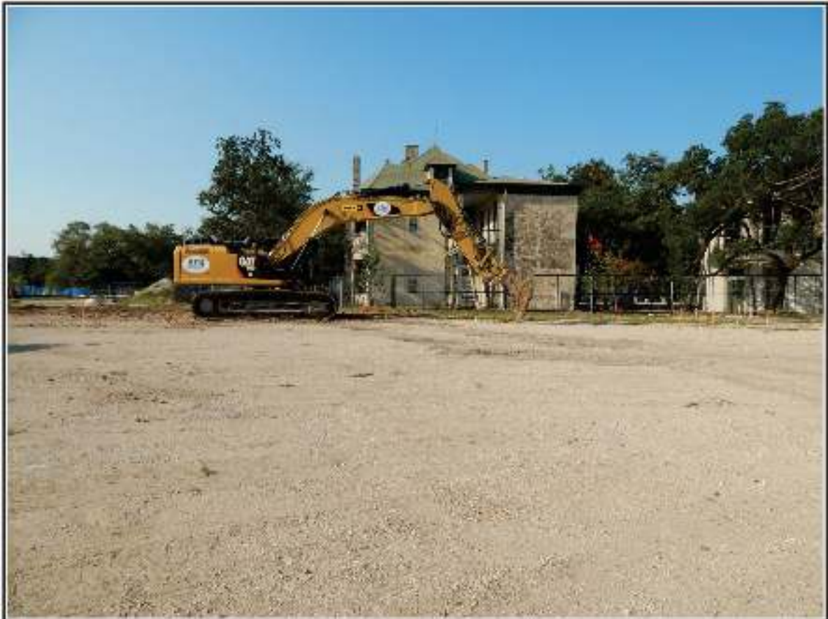
Figure 4-1. Vault location and excavation, facing south.

As noted in Chapter 2, results from work on the Acequia Madre de Valero (Nichols et al. 2017) led Tomka et al. (2017) to present a mitigation and preservation plan for the uncovered 40-m (131.23-ft.) segment of the acequia. The plan consisted of the introduction of several inches of sand covered with landscape fabric on top of the feature. This buffer would be topped with perforated steel plating. The sluice gate and associated elements of the acequia would be