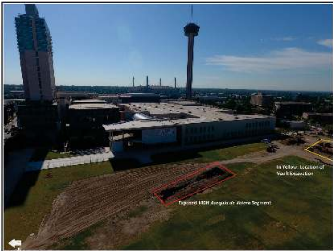
Figure 4-9. Exposed acequia in relation to the Convention Center and vault excavation, facing east.