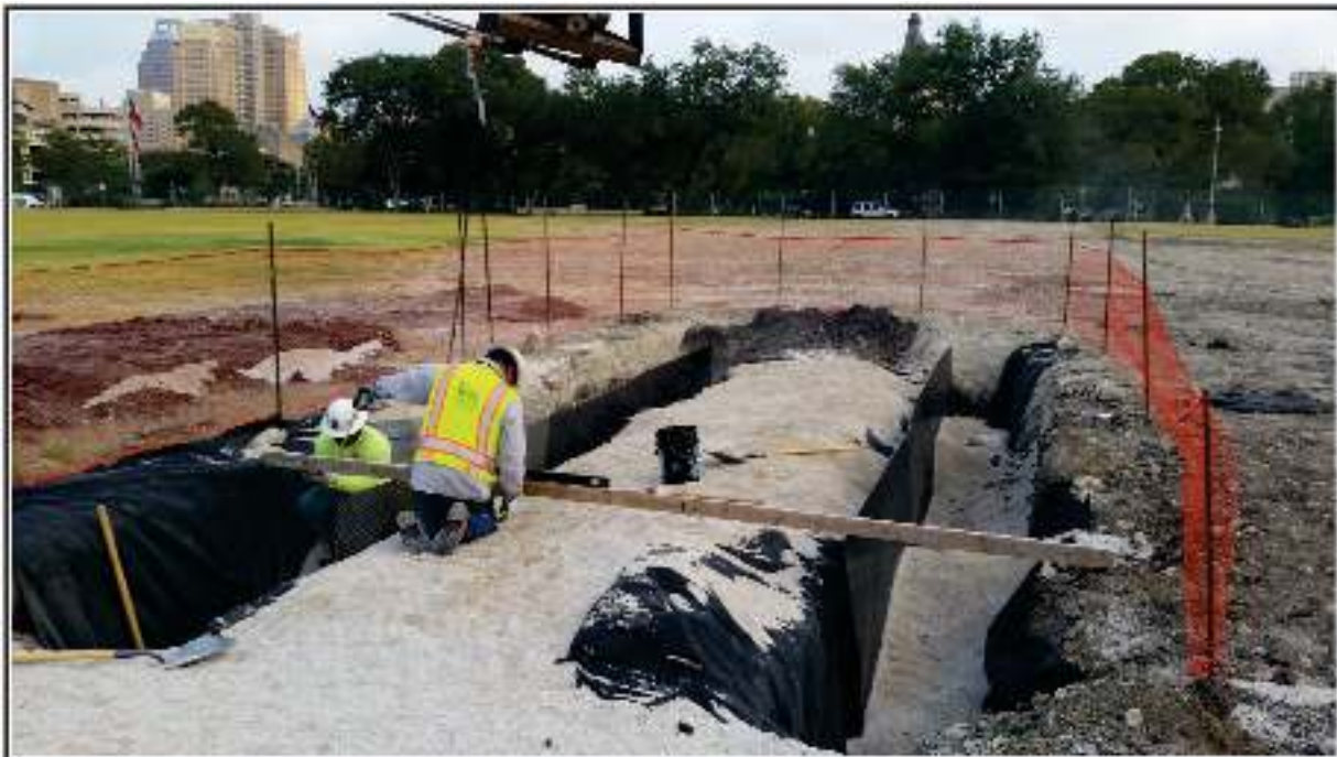
Figure 4-12. Guido Brother's crew measuring distance between outer wall steel plates on northern end, facing north.