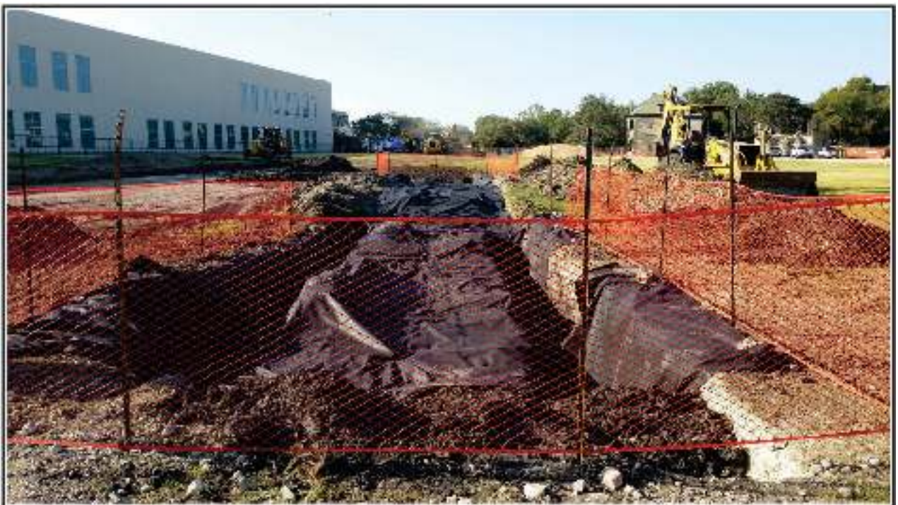
Figure 4-10. Black felt landscape fabric covering the acequia, facing south.