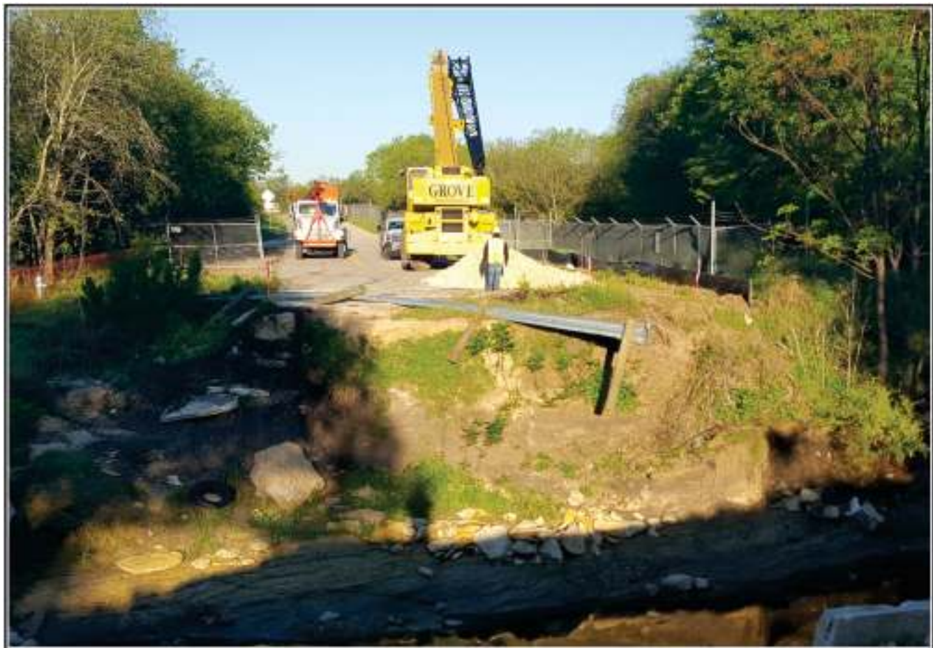
Figure 4-1. The banks of Sixmile Creek within the APE, taken from the east bank along Ashley Road.

culvert and bridge had been washed out in flooding events. The washed out concrete culvert was removed on March 17, 2016. On March 31, 2016, two holes were drilled reaching a depth of 11.3 m (37 ft.) for piers that would support the newly constructed bridge. The auger bit measured 60 cm (24 in.) in diameter. No cultural material was observed during the drilling of the pier holes on the east bank. As seen in Figures 4-2 and 4-3, the slope of bank was graded for the placement of a concrete riprap to create a six percent slope. Modern material in the form of a cassette tape was noted; however, no historic material was observed during these excavations.