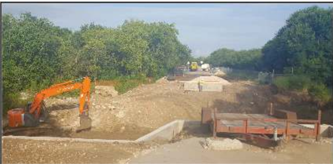
Figure 4-3. Concrete riprap on the east side of the creek.