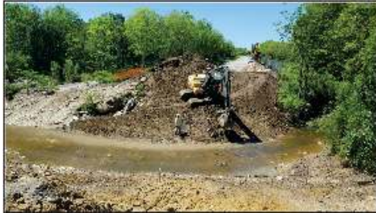
Figure 4-9. Grading of slope on east bank of Sixmile Creek.

Sixmile Creek. On the same day, CAR archaeologists noted the removal of the road asphalt and fill at the corner of Ashley Road and Acequia Road (Figure 4-10). These activities did not require monitoring. Concrete ripraps had also been poured prior to the last day of fieldwork (Figure 4-11).