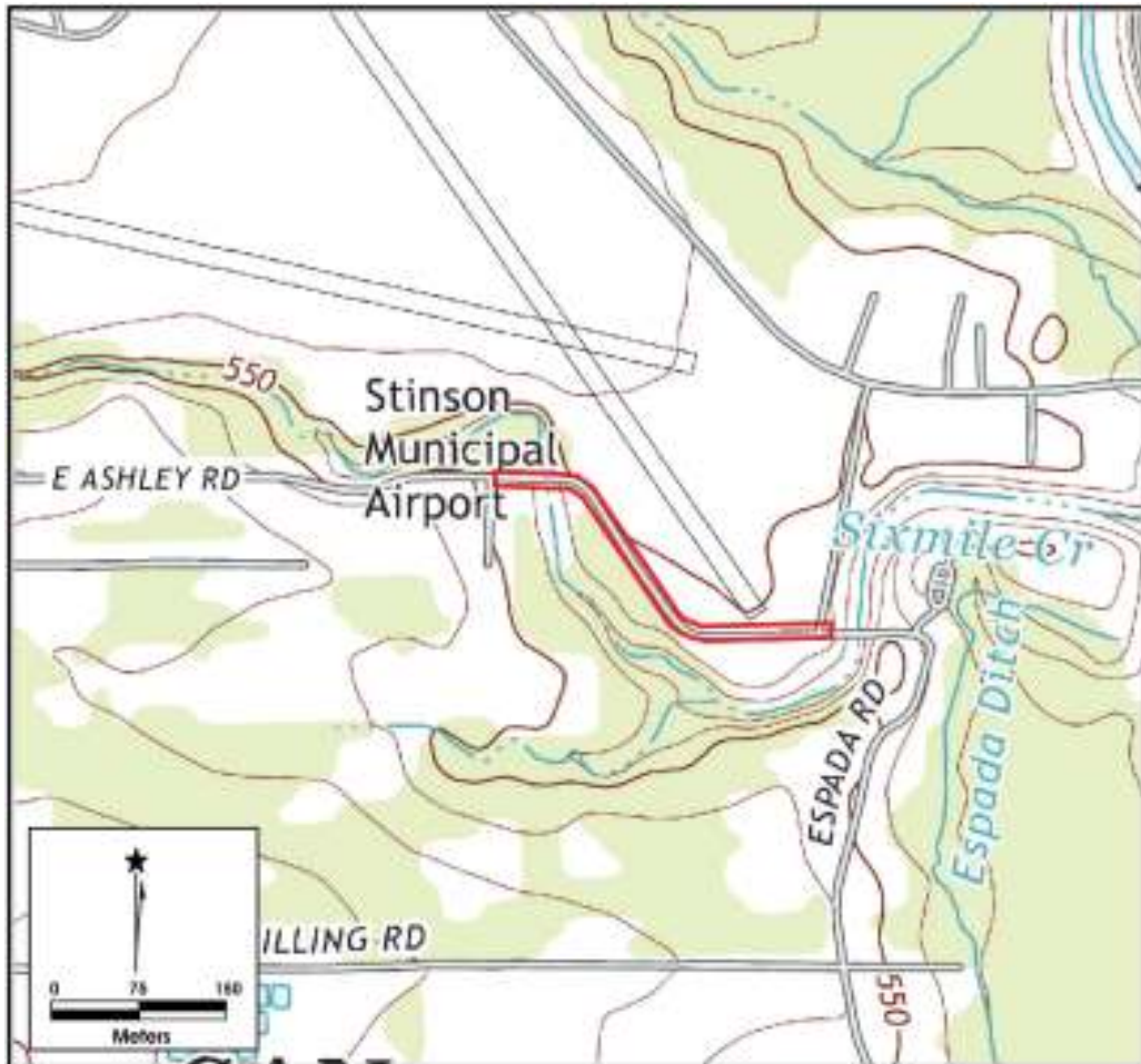
Figure 1-1. Project APE (outlined in red) on the Southton USGS 7.5-minute quadrangle map.

The Area of Potential Effect (APE) is located 600 m (1,968.5 ft.) east of the intersection of East Ashley Road and Roosevelt Avenue, to the east and southeast along Ashley Road, and ends just past the intersection with Acequia Road. The APE is approximately 0.66-km (0.41-mi.) long and 19.81-m (65-ft.) wide for a total of 0.90 hectares (3.23 acres). The construction impacts occurred mostly on the creek banks and in association with road and base removal.