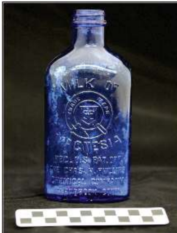
Figure 4-8. Phillips'® Milk of Magnesia bottle, collected from Feature 1.