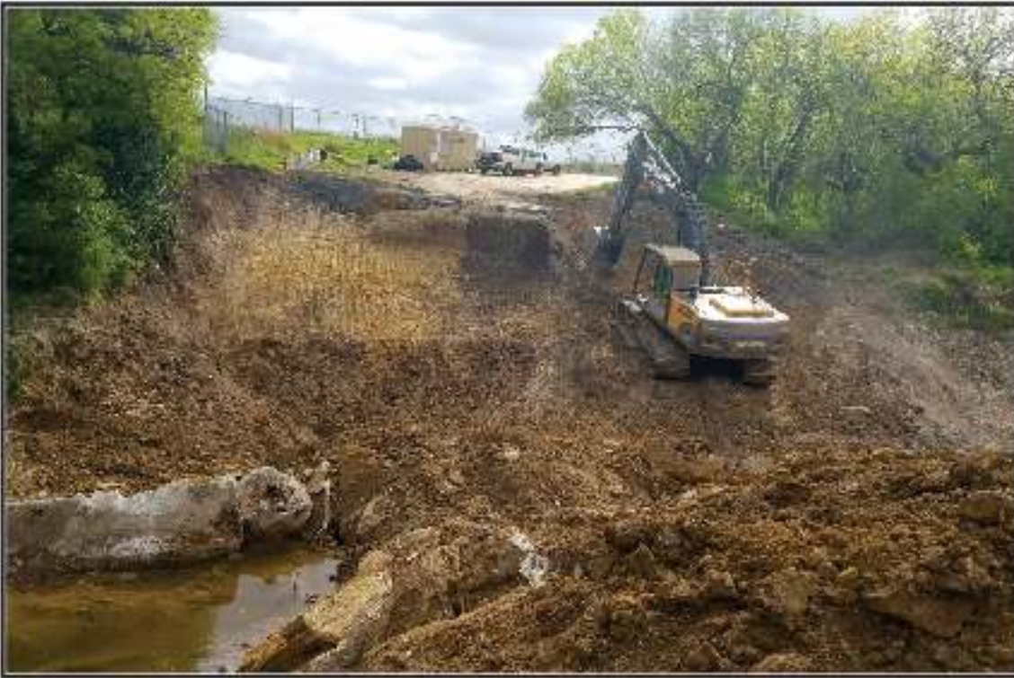
Figure 4-2. Grading of east bank of the creek for riprap.