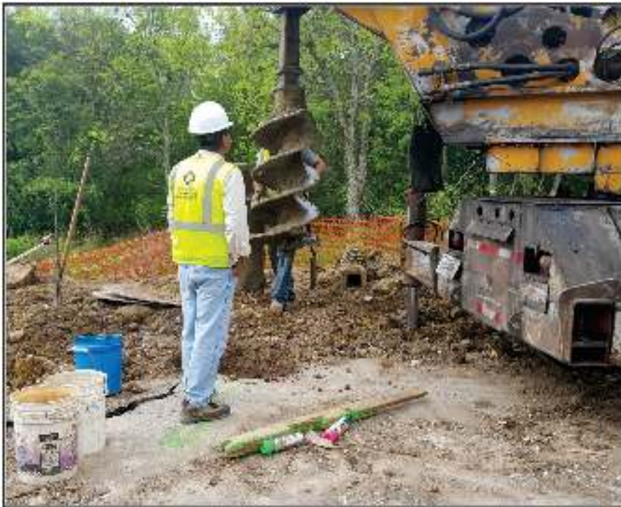
Figure 4-4. Drilling of holes for pier installation on the west bank.

On March 24, 2016, during excavations associated with the slope grading for the concrete riprap on the northern side of Ashley Road, Feature 1 was encountered 0.9 m (3 ft.) below the asphalt. It consisted of a scatter of bottles, ceramics, and metal. As shown in Figure 4-5, Feature 1, subsequently recorded as site 41BX2138, measured 3 m (9.8 ft.) in length