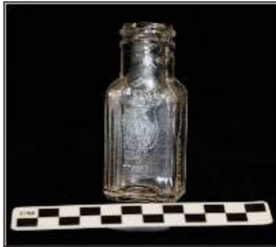
Figure 4-7. Gebhardt Chili Powder bottle recovered from Feature 1.