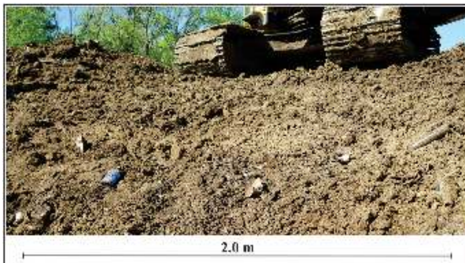
Figure 4-5. Photo of Feature 1 on west bank of Sixmile Creek, north side of East Ashley Road.