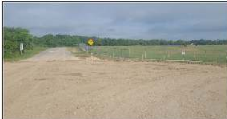
Figure 4-10. Asphalt and base removal at the corner of Ashley Road and Acequia Road.