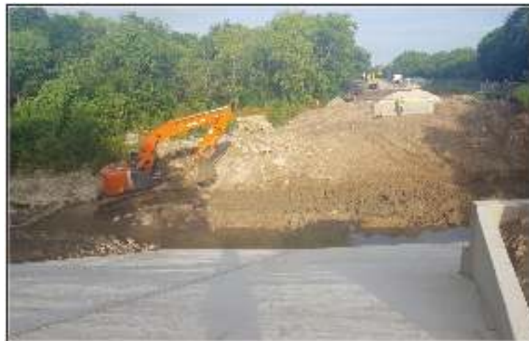
Figure 4-11. Picture of APE taken on June 27, 2016 (facing west).