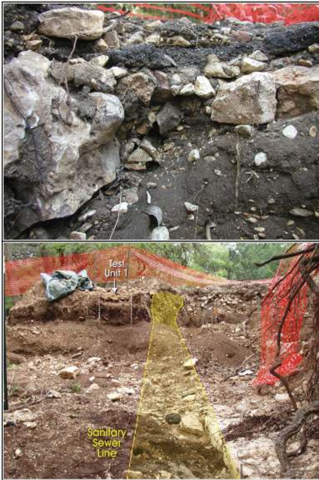
Figure 3-3. Fire-cracked rock embedded immediately below road base (top). Image (bottom) shows the path of the sanitary line in relation to the location of the test unit.