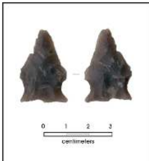
Figure 3-2. Fairland projectile point found in test unit.

Both prehistoric and modern artifacts were found throughout the test unit. Table 3-1 gives the types and counts of artifacts found by level. As noted in Chapter 1, a projectile point identified as a Darl was found by a local resident in the vicinity of the test unit. During excavation, another projectile point was recovered 40 cm below the datum and identified as Fairland (Figure 3-2). Both artifacts suggest that the deposit has a Late Archaic affiliation. Fire-cracked rocks ranging in size from 5 cm to 15 cm in diameter were recovered in all levels. Modern materials were found in all but three of the levels with Level 9, second to the deepest level, having glass, metal, and asphalt. The occurrence of modern materials throughout the unit, as well as the depth of this intrusion, would suggest that vertical mixing has occurred.