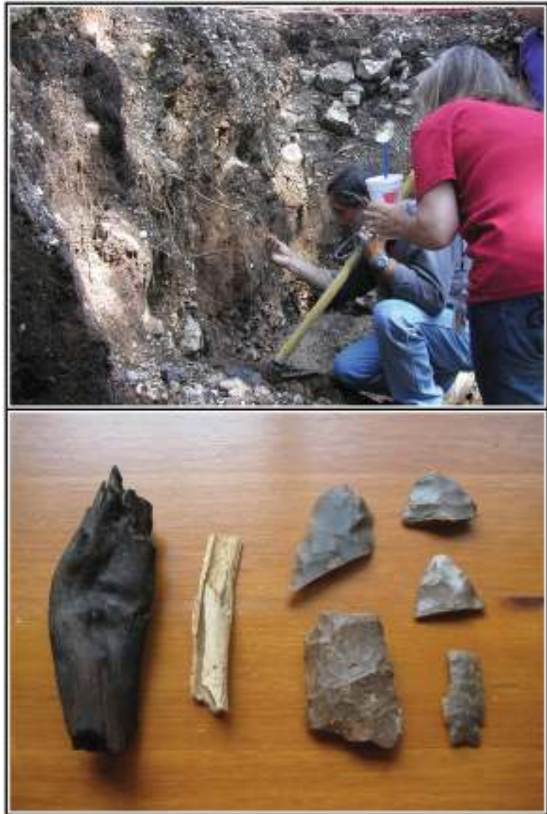
Figure 1-2. Portion of terrace deposits containing cultural materials (top). Carbonized wood, bone, and chipped lithic tools, including a possible Darl point, collected from project area (bottom).

The fact that the proposed work would take place on land owned by Bexar County, a political subdivision of the state, brings the project under the jurisdiction of the Antiquities Code of Texas. Also, because the project occurs within the limits of the City of San Antonio, the project falls under the jurisdiction of the City of San Antonio Unified Development Code, Chapter 35. The principal oversight agency is the Archeology Division of the Texas Historical Commission (THC). Archaeological investigations were conducted under THC Permit No. 5030.