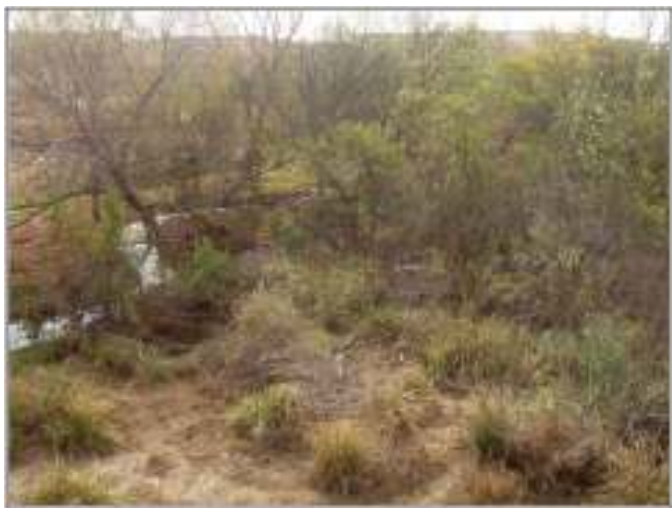
Figure 2-2. Photograph depicting the project area showing the riparian vegetation of Chacon Creek.

live oak ( Quercus sp. ), cottonwood ( Populus fremontii ), sugar hackberry ( Celtis laevigata ), and sycamore ( Platanus occidentalis ) can be found. Blair (1950) lists 61 animal species native to the region including white-tailed deer ( Odocoileus virginianus ), cottontail ( Sylvilagus floridanus ) and jackrabbits ( Lepus californicus ). Bison ( Bison bison ), pronghorn ( Antilocapra americana ), bear ( Ursus americanus ), wolf ( Canis lupus ) and jaguar ( Felis onca ) were all once found in the region, although no longer. Modern species introductions include the armadillo ( Dasypus novemcinctus ) and javelina ( Pecari tajacu ).