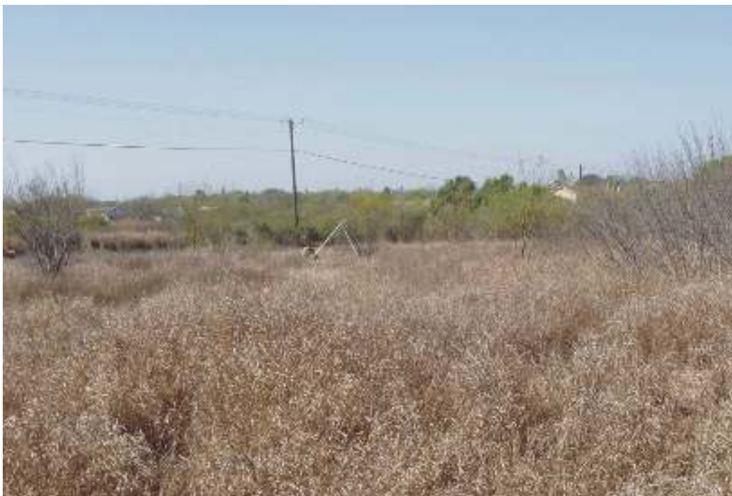
Figure 4-2. Photograph of “southern portion” of project area showing dense grass cover.

additional shovel tests, as well as 1-x-1 m test units could be placed within their respective boundaries. 41WB413 was reexamined and no archaeological artifacts or features were found on the surface or revealed in the eroded drainages. No additional shovel tests or test units were placed within the boundary of 41WB413 (Figure 4-3). Furthermore, CAR concurs with the previous assessment (Maslyk et al. (1997) that 41WB413 is not eligible for nomination to the NRHP.