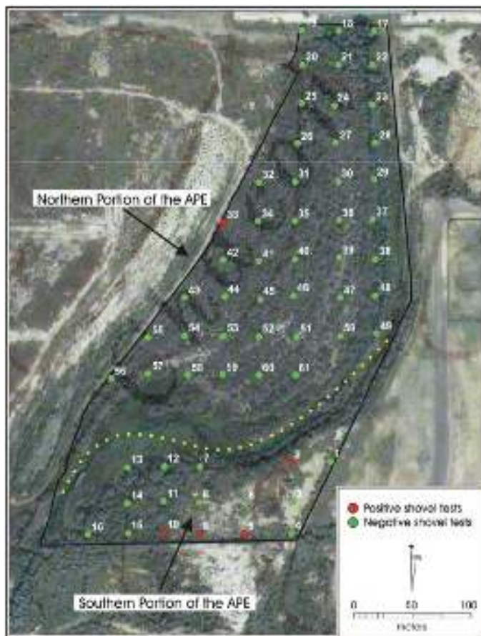
Figure 4-1. Map showing distribution and results of shovel testing.

Sixty shovel tests were excavated within the APE (Figure 4-1). Of the sixty shovel tests, five shovel tests were positive for cultural materials. Appendix A lists the depths and artifacts recovered from all shovel tests. Using the delineation of “northern portion” and “southern portion” introduced in the methods chapter, this section divides the discussion of the results of testing based on this nomenclature.