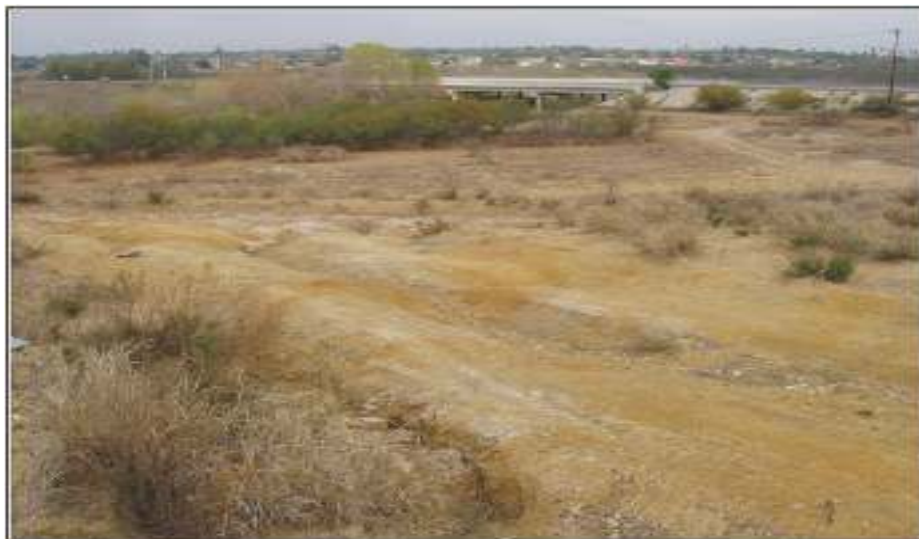
Figure 4-3. Photograph of 41WB413 showing damage to site from erosion.

Three test units were placed adjacent and within site 41WB414 (Figure 4-4). The placement of the three units was based on the results of shovel testing, as well as surface artifact concentrations. Test Unit 1 (TU1) was located in the western most portion of the site at its lowest elevation and immediately north of ST10. The location of Test Unit 2 (TU2) was based on the relatively high concentration of visible surface artifacts. Test Unit 3 (TU3) was placed within the original boundary of 41WB414. It is the furthest east of the three units and its location is at the highest elevation of the project area. This section describes the eligibility testing of 41WB414. Appendix A lists the provenience of all artifacts recovered during this phase of testing.