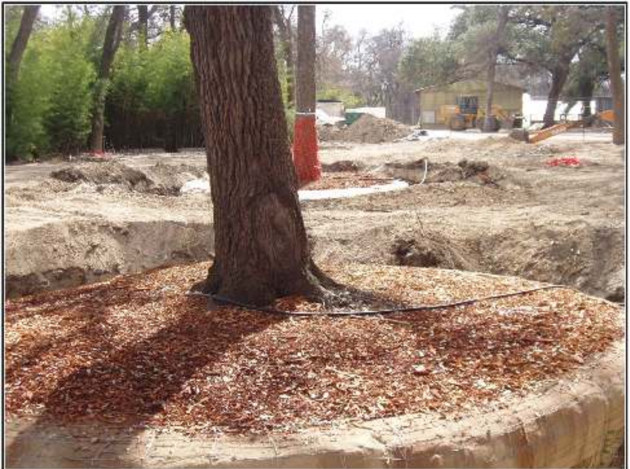
Figure 3-1. Tree extraction in the northern portion of the APE

In the north-central portion of the APE, three auger excavations (2, 5, and 9) were positive for cultural material (burned rock, lithic debitage and lithic tools). Four additional auger tests were excavated within 5-m of the positive tests.