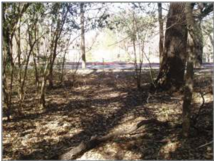
Figure 3-2. The proposed route for the re-alignment of San Antonio Zoo Eagle train railroad.