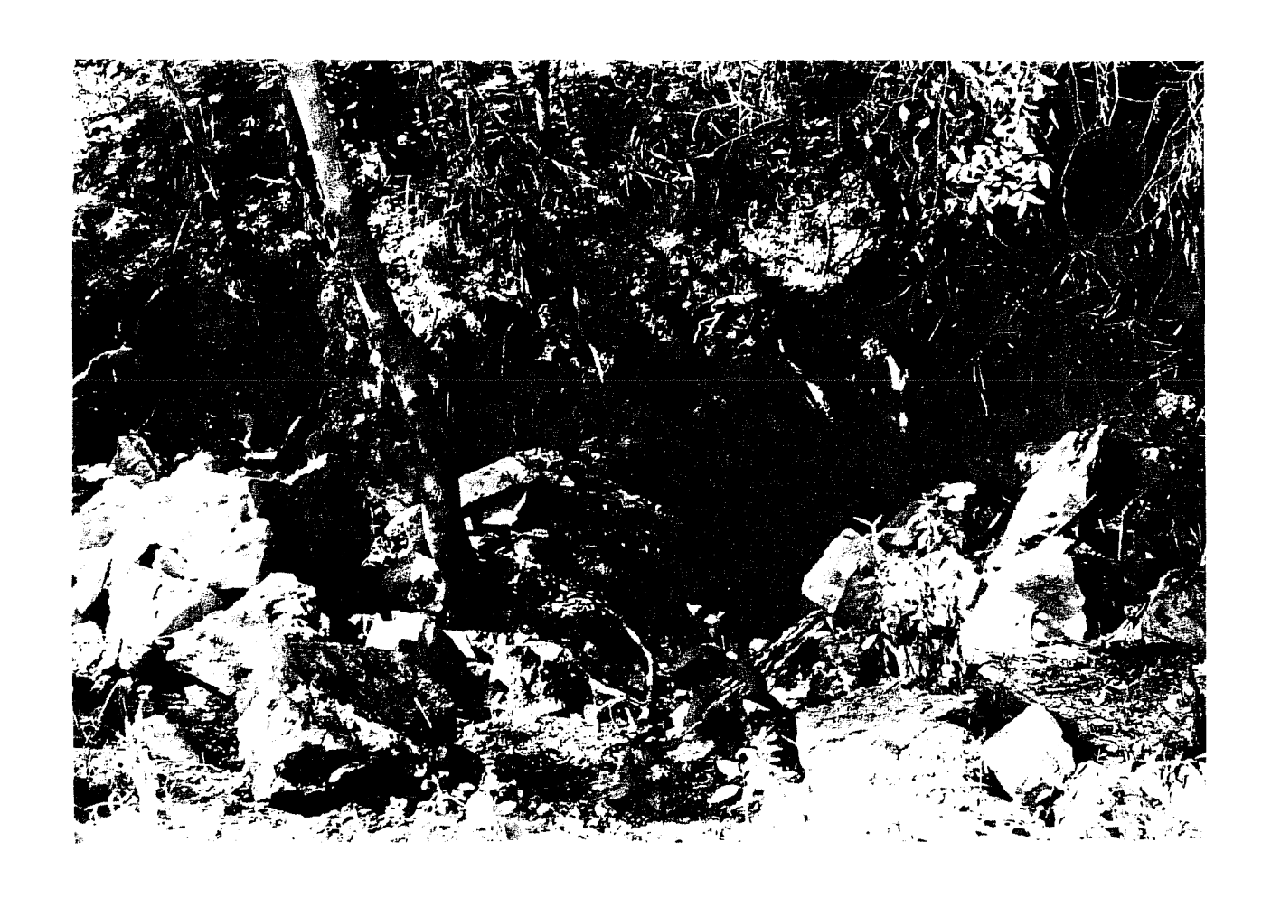
Figure 3. Worth's Spring. The spring is located near the northeast end of Olmos Dam.